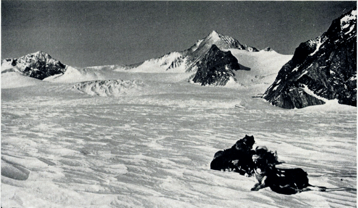
Fig. 3. Small glaciers spilling from the ice cap through mountain passes on the north side of the Budolfi Glacier (Isstrom)