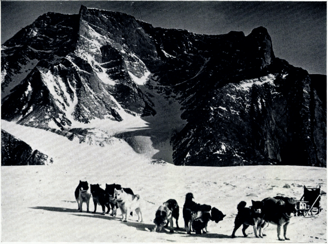
Fig. 2. A corrie on the north wall of the upper Budolfi Glacier (Isstrom)