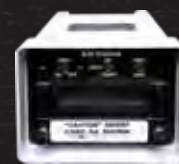
AN/USQ-131-B Memory Loader Verifier System (MLVS)