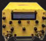
AN/ALM-295 Countermeasures Dispenser Test Set (CDT)