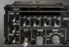
Control Display Unit (CDU)