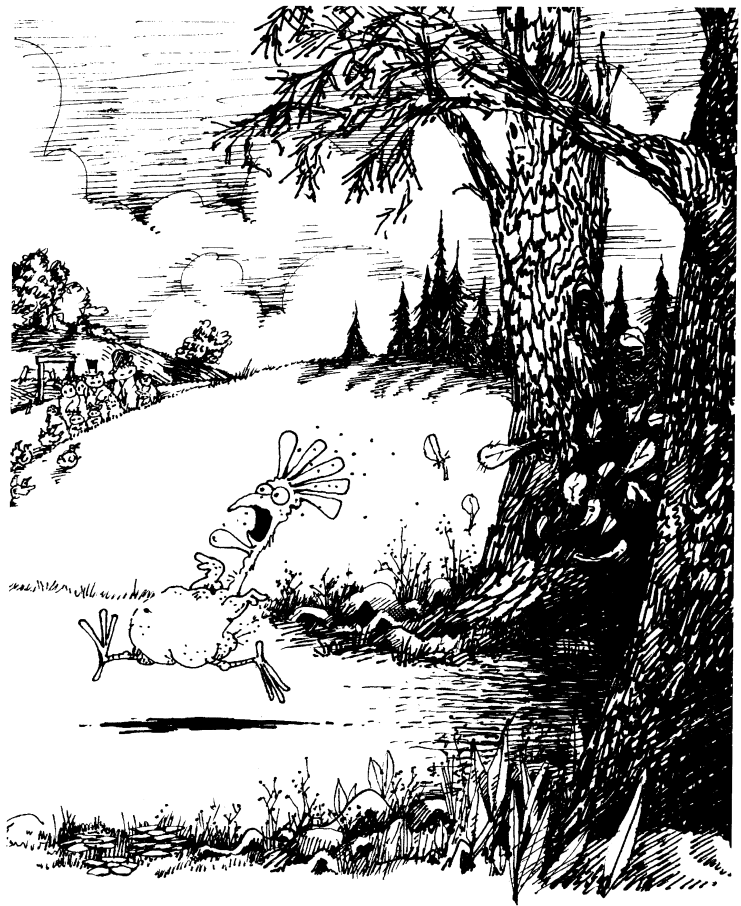
Exhibit #4: It's Alive! Find a photo or news story about an animal or insect that would make a good exhibit. Create an exciting title for your exhibit. Write a sentence making it sound mysterious and wonderful.