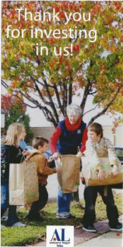
Operation School Bell® Sock Market A Sound Investment

About 900 Sock Market letters were mailed out on August 10. As of September 16, our 2011-2012 Sock Market had brought in $43,379. That is about $12,000 more than at this time last year.