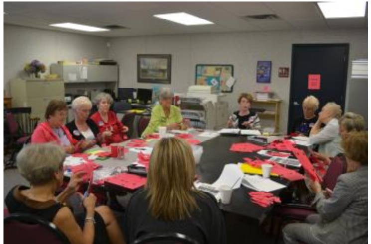
A LOT Public Relations Committee meeting with the McDonalds representative to prepare for Sock Night at McDonalds.

Thank you to all the volunteers who helped plan, cut socks, call for staffing, when to McDonalds, picked up supplies and return them for our Sock Night!