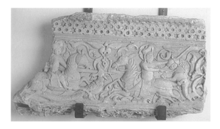
FIGURE 8. Stucco relief with mounted dragon and lion slayers, late 12thearly 13th century, from Konya, Museum of Turkish and Islamic Arts, Istanbul, 2831.