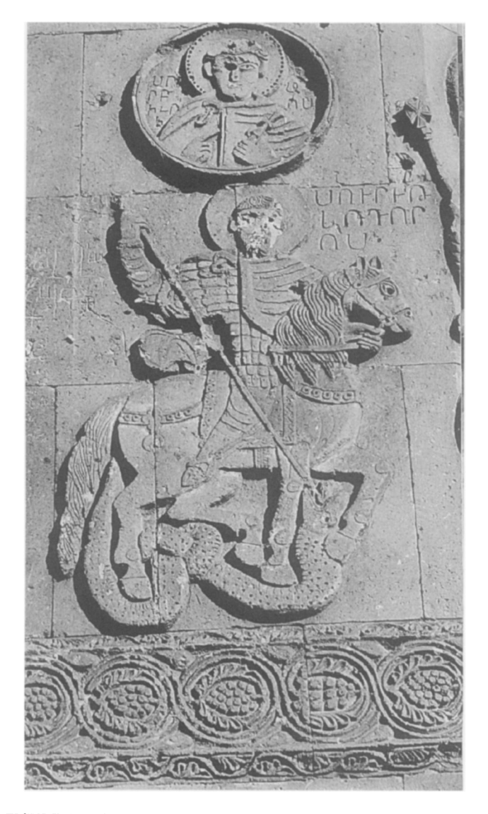
FIGURE 1. Relief carving of St. Theodore, 915-921, Church of the Holy Cross, Aght'amar (Van, Turkey).

of the Great Seljuk sultan Alparslan at Manzikert in 1071, allowing nomadic and opportunistic Turks to swiftly penetrate Anatolia. A precarious principality based in Nicea was established by a member of the extended Seljuk family as early as 1081. This early headlong Turkish political establishment in Anatolia was challenged not only by the Byzantines and the Crusaders but also by the competition among nascent rival Turkish polities including the Seljuks of Rum, the Danishmendids, and the Saltukids. The social and political viability of the Turkish populations in Anatolia was proven only by the second half of the next century, when the Rum Seljuks, now based in Konya, began to gain the upper hand over their rivals and create the necessary conditions for effective sociopolitical institutions and cultural products.