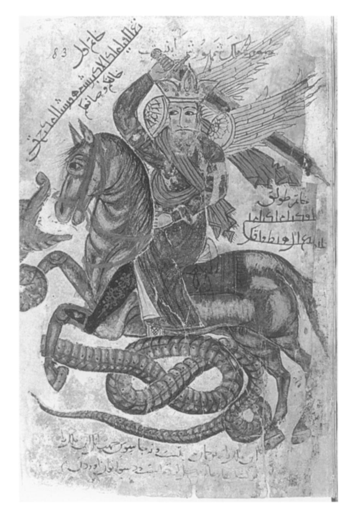
FIGURE 12. The angel Shamhurash, from Daqa'iq al-haqa'iq, Anatolia, midto late 13th century, Paris, Bibliothèque nationale de France MS pers. 174, fol. 83.

in which the direct appeal of easily legible images apparently prevailed over the message of traditional formulaic inscriptions.<sup>58</sup> Given that it is harnessed to express the notion of victory in a funerary context, the presence of the dragon slayer on this tombstone seems to echo the popular eschatological symbolism of the painting decorating the entrance of the Y1lanlı Kilise in the Ihlara Valley.