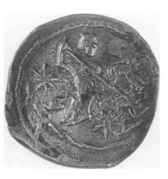
FIGURE 7. Copper coin of Mu<sup>c</sup>izz al-Din Qaysarshah (obverse) from Malatya, 1186–1201, Yapı Kredi Bank, Vedat Nedim Tor Museum, Istanbul.

refuge in the Ayyubid court; and again in 1201 for good. Thus, Qaysarshah's revival of the dragon-slayer on his copper coinage may have been conceived to forge a link with Malatya's recent Danishmendid past in the face of mounting political pressures. Because the circulation of copper coinage would have been restricted to local exchange, Qaysarshah's dragonslayer coin must have derived its significance, legitimacy, and value from local monetary history and context.