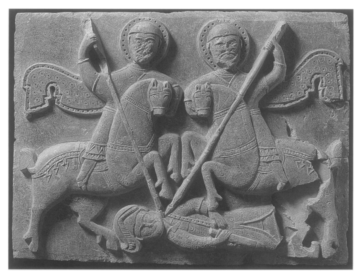
FIGURE 3. Stone relief plaque with two saints slaying a prostrate tyrant, from Amasya, 11th or 12th century, Benaki Museum, Athens, 33630.

at Aght<sup>3</sup>amar, the phenomenon of repetition was amplified to include a sequence of three saints on horseback—Theodore, Sergius, and George—each wielding a spear against, respectively, a dragon, a panther, and a fettered man.<sup>18</sup>