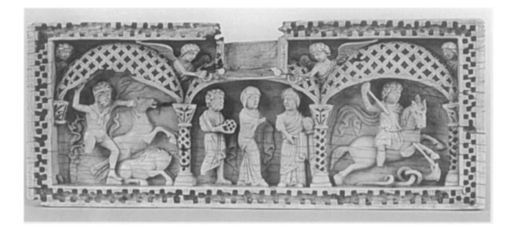
FIGURE 5. Front panel of the Darmstadt Casket, ivory, probably Constantinople, 12th century, Hessisches Landesmuseum, Darmstadt (Germany), KG 54:215 a (photo: Hessisches Landesmuseum Darmstadt).

iconography with Byzantium. In addition, the messianic identification of the dragon slayer as 'Ali manipulates that association for the benefit of Islam, a manipulation made possible by the universal legibility of the image.