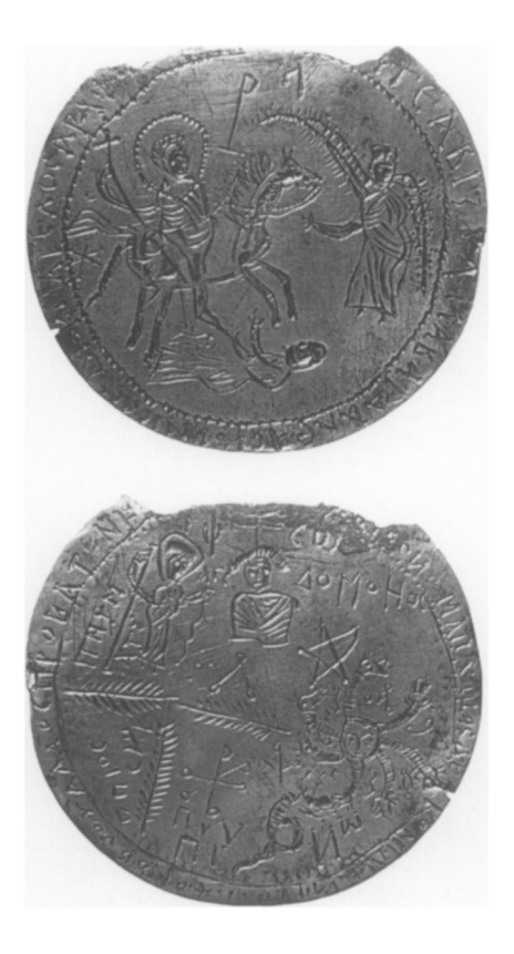
FIGURE 2. Silver amulet with the Holy Rider, Anatolia, 12th century, Ashmolean Museum, Oxford, 1980.53.

Two side panels of a ninth- or tenth-century Constantinopolitan triptych icon in St. Catherine's Monastery at Mount Sinai appear to bear out St. Theodore's comparatively earlier connection with dragon slaying and St. George's later acquisition of the same feat, probably through his association with