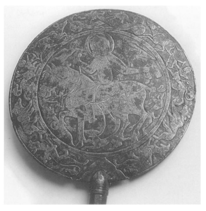
FIGURE 10. Steel mirror inlaid with silver and gold, Anatolia, early 13th century, Topkapı Palace Musuem, Istanbul, 2/1792.

and privilege.<sup>50</sup> On these candlesticks the equestrian dragonslayer typically appears in a composition with a polo player and a falconer, exemplifying, respectively, the princely pastimes of sporting and hunting. Each is on horseback and contained within a roundel. The shared equestrian motif draws the