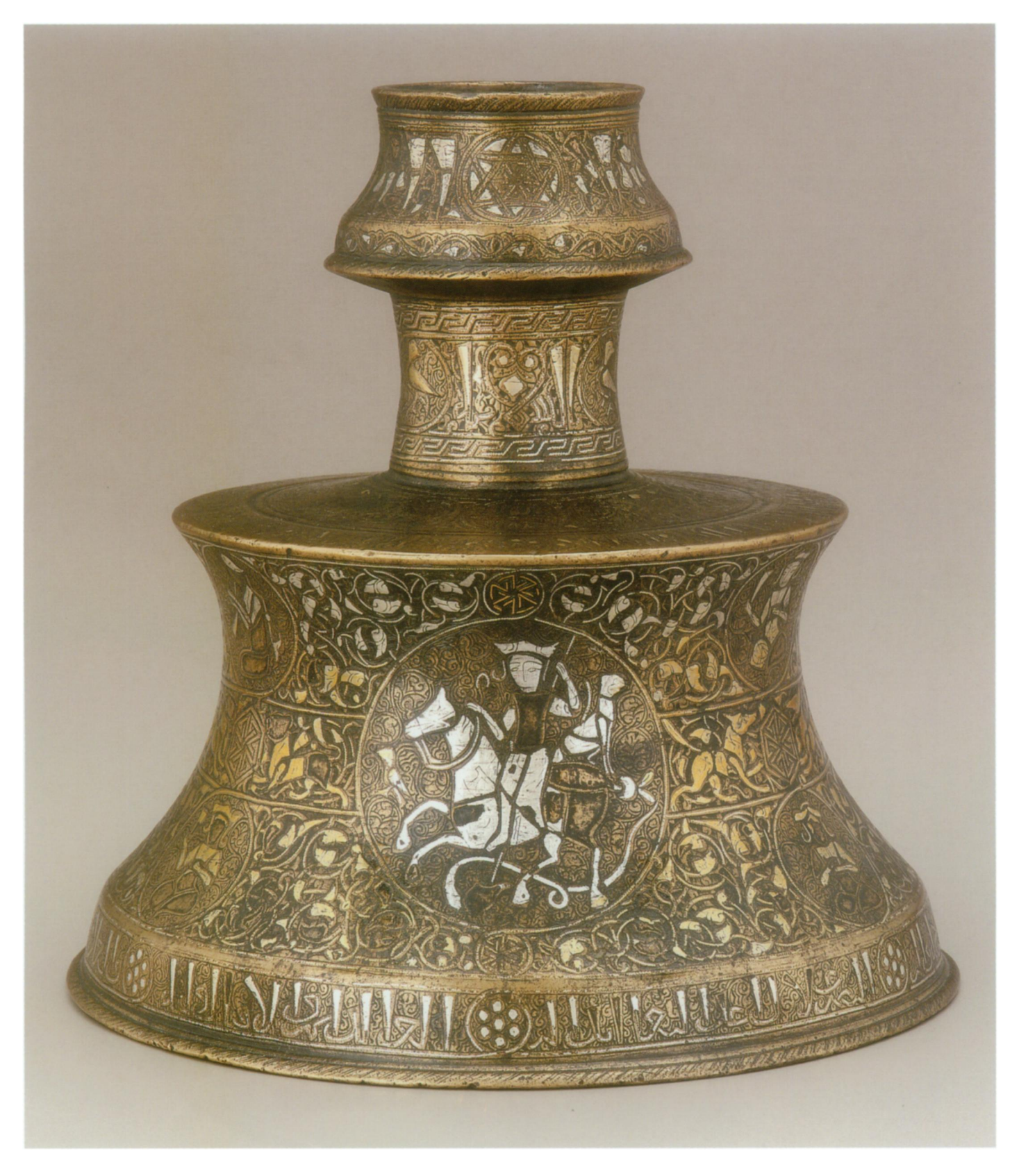
PLATE 2. Bronze candlestick inlaid with silver, Anatolia, 13th century, Nuhad Es-Said Collection of Islamic Metalwork, Arthur M. Sackler Gallery, Washington, DC, LTS2000.1.7 (photo: courtesy of the Arthur M. Sackler Gallery, Smithsonian Institution, Washington, DC).