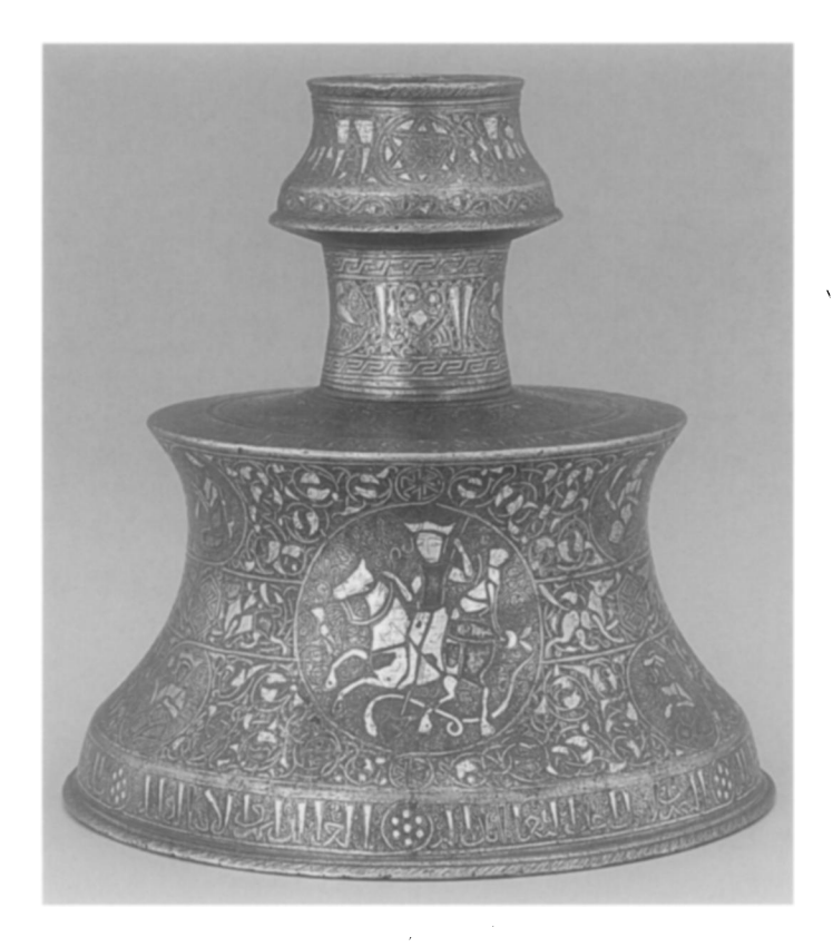
FIGURE 9. Bronze candlestick inlaid with silver, Anatolia, 13th century, Nuhad Es-Said Collection of Islamic Metalwork, Arthur M. Sackler Gallery, Washington, DC, LTS2000.1.7

and privilege.<sup>50</sup> On these candlesticks the equestrian dragonslayer typically appears in a composition with a polo player and a falconer, exemplifying, respectively, the princely pastimes of sporting and hunting. Each is on horseback and contained within a roundel. The shared equestrian motif draws the