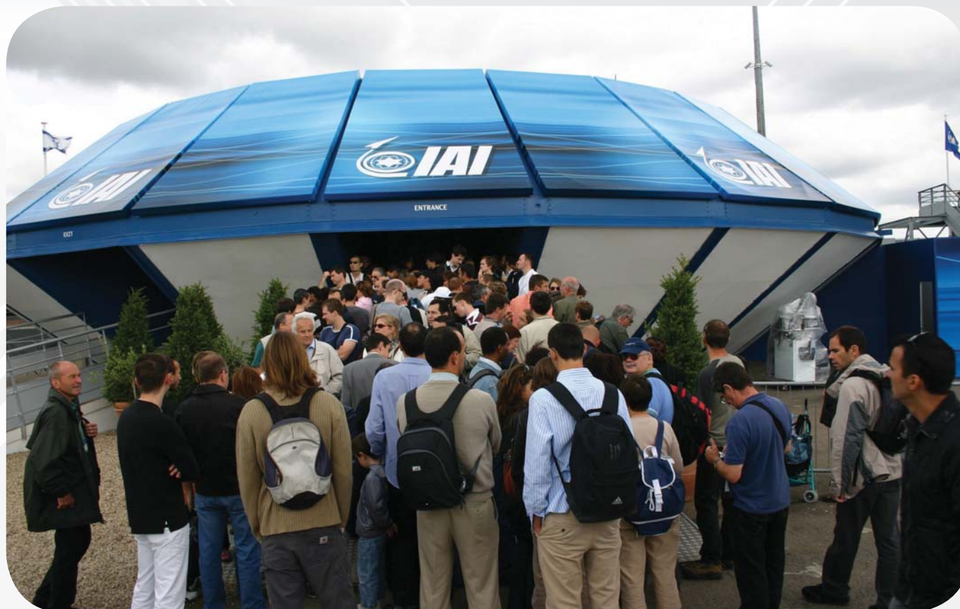
Panoramic 180° movie Seamless projection 23.5 x 2.5 m screen

以色列航天工业公司2007年巴黎航展展示 航展中我们的设计独占鳌头，全面展示了以色列航天工业产品和公司信息。“IAI思想之线”是一次视觉之旅，通过10台无缝投影仪在180度2.5米高的银幕上放映特效全息电影带领参观者感受以色列航天工业公司的方案，重点刻画公司独一无二的创新能力，专业能力和在众多领域中所取得的成就。这是一个高度依赖视觉效果和内容创意来展示品牌吸引力的例子，它不但让参观者兴奋起来，而且让观众记住了以色列航天工业公司的产品和解决方案。