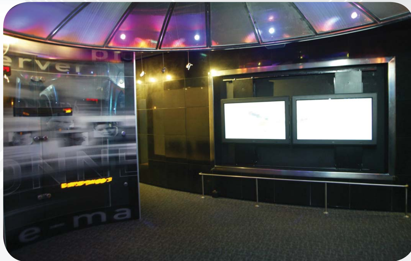
Visitor Center Business 250 sqm

Bezeq是以色列最大的电信供应商。设立访客中心的目的在于促进商务交流。通过运用独特的技术和以内容为驱动的解决方案，配合最先进的技术平台，该中心还具备活动推广功能 - 配备了一个装备优良的会议室和一个多功能厅。在最好的视觉专家，最好的视频制片人，最好的布景设计师和技术人员的共同合作之下，Bezeq被定位为全球同行业最为引人瞩目的企业，通过展示中心将其风采展示给世界。