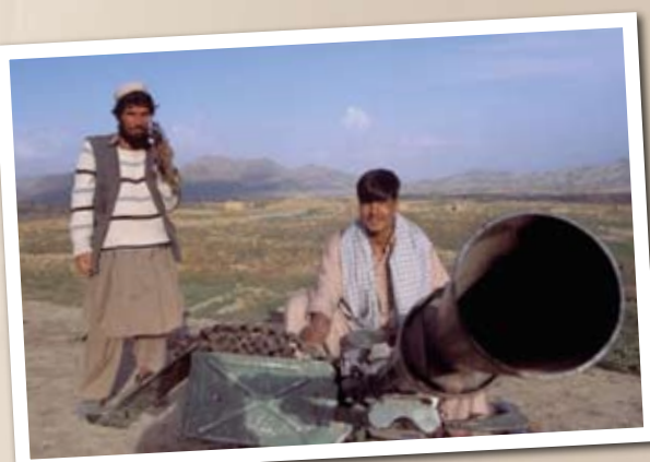
Northern Alliance guards on the road to Kabul