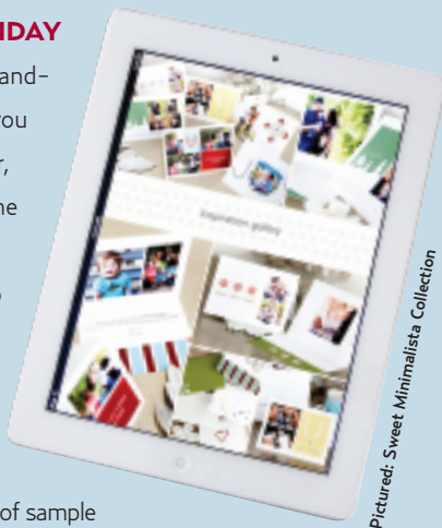
Pictured: Sweet Minimalista Collection

are a mix-and-match sales system that enables you to work smarter rather than harder, save time, boost sales, and streamline your holiday workflow. Each kit comes with everything you need to launch a line of holiday cards within minutes of download. You get a 10-page card sales catalog with a built-in order form on the last page, plus professional stock photos of sample cards for display. Just add your logo, edit the policies to reflect your own, and drop in your prices on the last page. PRICE: $115. designaglow.com