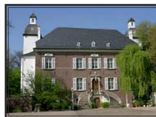
Lauersfort Castle and Peterhof

The Lauersfort castle was also built on wet lands. The east side of the building was erected in the 15th century and the west portion with its outdoor steps was added on in the 18th century. Close to the castle is the Peterhof built in the 19th century using the style of Karl Friedrich Schinkel.