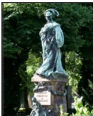
Statue of Luise Henriette

Moers castle. Always an area with a prestigious well-kept charm, the castle was originally occupied by the Earls of Moers. Today the castle is a museum. A visit to the museum is a journey through the history of Moers and the lower Rhein area stretching from the Roman times to the 20th century. After visiting the museum, a look at the theater, also located in the castle, is a must. This modern playhouse is well known throughout the area.