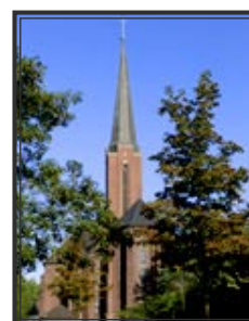
Church - St. Josef

This church was built in Gothic style between 1868 and 1871. A baroque group of figures is located in the choir section (Mary Heimsuchung).