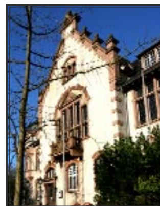
Home of the VHS

The historic Old Town (Altstadt) of Moers was redeveloped between the mid 1960's and the late 1980's. Its neat lovingly restored alleys and new houses built with respect to the older sizes and styles invite all passersby to stroll through the old city. During this time the center of the Old Town was also redeveloped into a pedestrian area. This car free zone has a comfortable flair offering a variety of high quality shops and interesting pubs and restaurants.