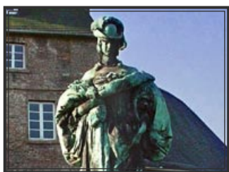
Statue of Luise Henriette

In front of the castle, Moers-City Center