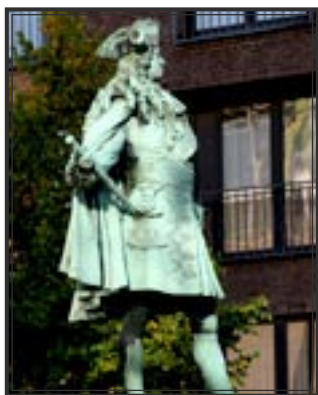
Statue of King Friedrich I

At the other side of Fieselstr. you will see the „Brandgassen“ (Brand-alleyways), which once lined the city wall. Continuing right onto Neustr. brings you to the Neumarkt (New Market Place) with the statue of King Friedrich I. About 350 years ago a „sea“ separated the