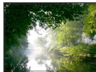
The green heart of Moers

1836 by Maximilian Weyhe modeling an English garden. A walk through this „green heart of Moers“ along the castle moat and embankments formerly the city wall, and by some rather exotic groups of trees, is recommended.