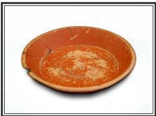
First proof of settlement

First Roman camp (Asciburgium) in Moers-Asberg was established by Drusus, King Augustus' step son. As a result, a border (no longer respected) developed on the left embankment of the Rhein called