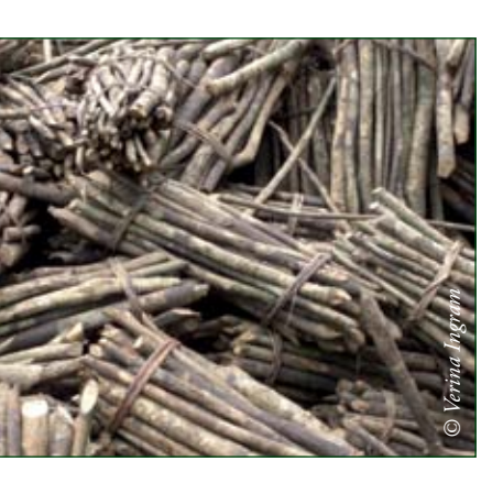
Photo 7.10: Collections of "cattle sticks" near Takamanda National Park, Cameroon

In most Central African countries, access to permits for NTFPs is as complicated and comparable to trading in timber. The main difference tends to be the scale of capital outlay, which is much larger for timber, with long and cumbersome administrative procedures for small and medium scale business (Tieguhong et al., 2010; Ndove & Awono, 2009; FAO, 2009). In Cameroon, for example, "Special forestry products" are regulated by the forestry administration through a system of quotas set annually. Although the committee deciding the products annually is drawn from different ministries, the quotas set and allocated are not based on any resource inventories but are demand led. In some cases, social ties to members of the quota allocation committee and the influence of higher ranking officials play critical roles in the process. The consequence is that