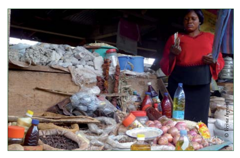
Photo 7.4: Market stall displaying various NTFPs in the Bamenda market in western Cameroon

There are wide variances in the sustainability of harvesting NTFPs and ultimately the livelihoods of those dependent on them. Examples of unsustainable practices are observed with Prunus africana harvesting in Cameroon, Equatorial Guinea, and DRC, for which international trade was suspended in 2007 due to fears of over-harvest. Another example is the bushmeat trade which is believed to be increasingly threatened by overexploitation (Fa & Brown, 2009). For valuable products, such as Gnetum spp. (see box 7.3), the high volume trade combined with low levels of domestication results in unsustainable harvests (Nde-Shiembo, 1999; Clark & Sunderland, 2004), whereas for Dacryodes edulis, Cola spp. and Raphia spp. species, high levels of domestication and integration into agro-forestry and farm bush systems have helped ensure the centuries long and Africa-wide trade is sustained.