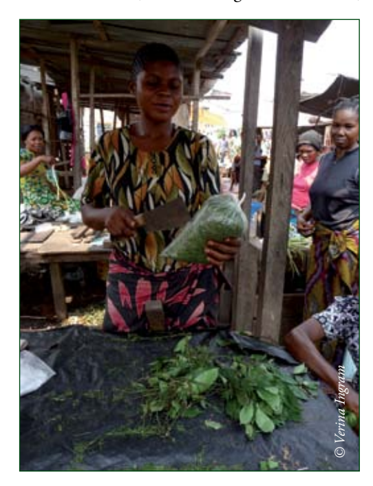
Photo 7.5: Fumbwa (Gnetum africanum) for sale in a local market in Kisangani, DRC

The species used as NTFPs, their abundance and density all change with ecosystem type, and with local variations in climate and altitude, making the selection of priority NTFPs highly location specific. For example, the mountains of Cameroon and Equatorial Guinea comprise only 2.5 % of Congo Basin forests, but contain at least 10,320 flora and fauna species, of which 25 % and 10 % respectively are endemic (Bergl et al., 2007) and approximately 23 % are used as NTFPs. An equivalent number of species are used in the swamp forests in Congo, DRC and Gabon, which cover 2.9 % of the basin's landmass (WWF, 2006), and the forest-savanna mosaics covering 31 % of the area (Dounias, 1996; Zapfack & Nkongo, 1999). Unsurprisingly, the majority of species are found in the lowland dense moist forest which comprises nearly 50 % of total forest cover in the region. Anthropogenic disturbances also change natural distribution patterns, for example when useful plants are unknowingly domesticated, such as groves of Irvingia gabonensis found along major footpaths within villages in the Takamanda area of Cameroon (Sunderland et al., 2009) and the spread of Cola spp. across Central and West Africa (Tachie-Obeng & Brown, 2001).