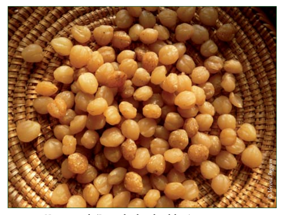
<sup>38</sup> Results of a FORENET Sub-Regional Workshop on Harmonisation of National Reviews on "Non-Timber Forest Products (NTFPs) in Central Africa", 17-18 May 2010, Douala, Cameroon.

These criteria together address holistically the economic, social and environmental aspects of "value".