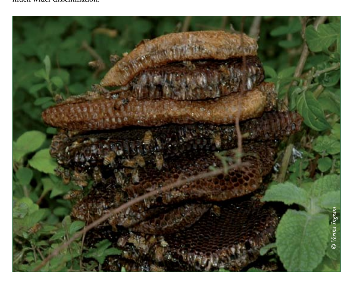
Photo 7.12: Honey is a common and very appreciated NTFP throughout Central Africa

Future needs include reinforcing the links so that researchers can inform policymakers and NTFP value chain actors on study findings; and a debate to develop consensus among actors in the value chains (harvesters, traders, regulators, consumers) on the criteria for "priority" NTFPs, using a "holistic" approach nationally and regionally. This could be coupled with the current revision of national forestry laws and enforcement mechanisms to ensure a harmonized regional approach. Management implies measuring, and so a realistic, common methodology for data collection and monitoring, is essential.