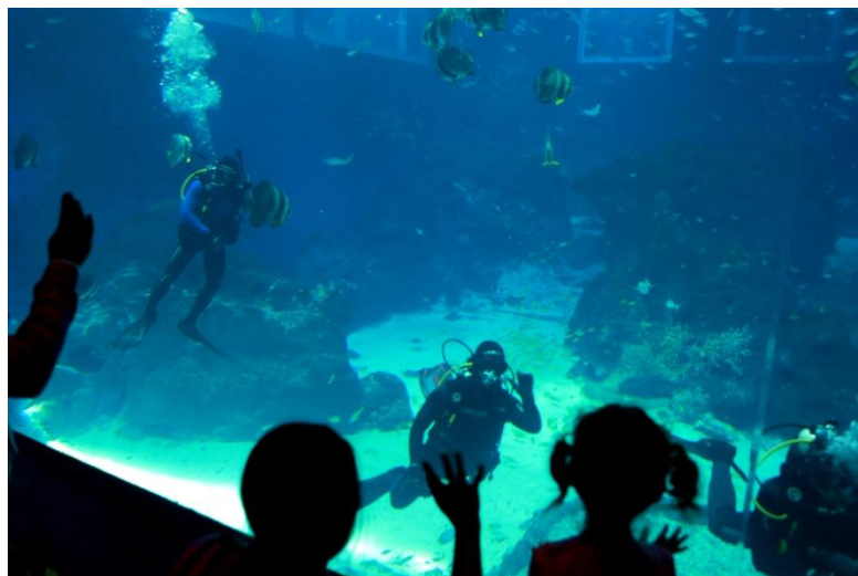
Guests waving to divers through the world's largest acrylic panel; the new Open Ocean Dive programme immerses the divers in the world's largest aquarium.