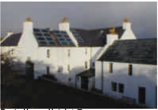
Busta House Hotel A V