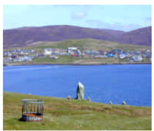
Brae from Busta