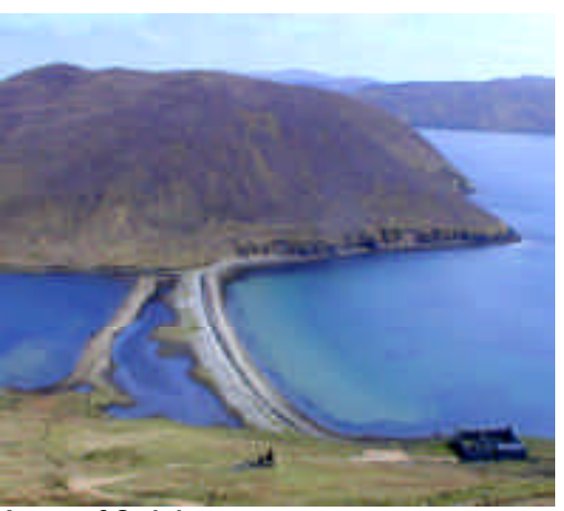
Ayres of Swinister

3.2 There are 7 SSSIs in the Delting area and a Marine Consultation Area at Swinister Voe. SSSIs are at: Burn of Valayre (trees), Dales Voe (salt marsh), Muckle Roe Meadows (flora), Quoys of Garth (geological), Ayres of Swinister (geological), Voxter Voe and Valayre Quarry SSSI (geological) and Yell Sound Coast. Yell Sound coast is also a cSAC with otters being an important part of the nature conservation interest. See Yell Community Council Area statement.