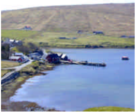
Lower Voe potential Conservation area