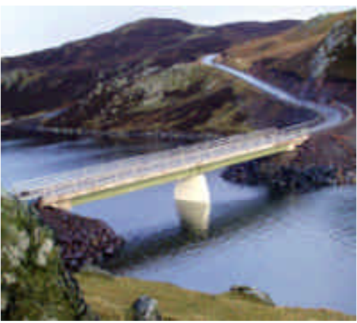
New Muckle Roe Bridge.

B9076 iunction in Brae (2002): reconstruction of the A970 in Brae from the Moorfield to Muckle Roe junctions with widening of the footpath (2003/4); A970 Tagon to Lower Voe footpath (underway); and works to the Kirkhouse Brig in Voe (now complete). There is a perceived need to extend the pedestrian footpath from the Muckle Roe junction into Brae. The Community Council have requested a lowering of the speed limit from 40 to 30 on this stretch of road.