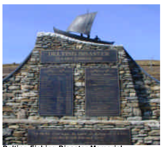
Delting Fishing Disaster Memorial

14.11 Public toilets are located at Voe, Brae and Toft.