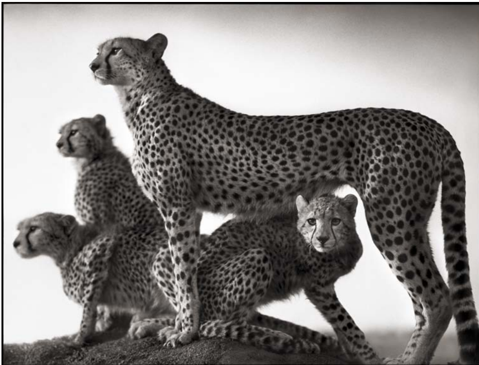
Cheetah and Cubs, Masai Mara, 2003

This world is under terrible threat, all of it caused by us. To me, every creature, human or nonhuman, has an equal right to live, and this feeling, this belief that every animal and I are equal, affects me every time I frame an animal in my camera. The photos are my elegy to these beautiful creatures, to this wrenchingly beautiful world that is steadily, tragically vanishing before our eyes.”