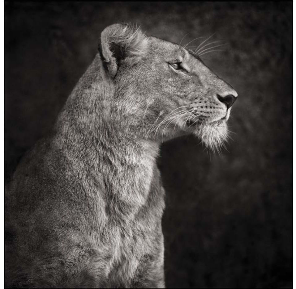
Portrait of Lioness Against Rock, Serengeti, 2007