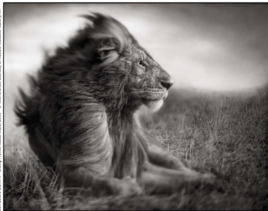
Lion Before Storm II - Sitting Profile, Masai Mara, 2006

“I shoot medium format film. It’s incredibly impractical for what I do - no zoom, no auto-focus, no auto metering, no motor drive, no image stabilizer lenses, just everything designed to make sure I screw up and lose the maximum number of shots in the process, and wait stressful nerve-wracking weeks waiting to see in the lab just how many I did screw up. But somehow, so far, it’s often worth it for the unexpected results: the way that sometimes, film can interpret what is in front of you in the most surprising, mysterious and magical way. It’s indefinable. But it’s something that I haven’t personally experienced with the more literal interpretation of digital cameras. Last year, growing frustrated by how many shots I was losing shooting with film, I bought a Hasselblad medium format digital camera, top of the range 60 megapixels. It cost tens of thousands of dollars. I had to try it in situ, in the places that I photograph. I took photos side by side with the film camera. The digital Hasselblad was sharper. It had more detail in both the shadows and the highlights. And I hated it. For me, the images