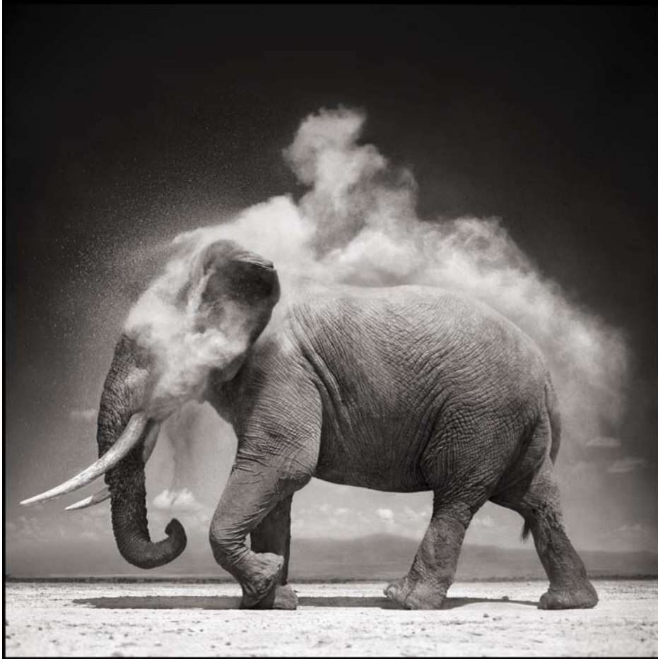
Elephant with Exploding Dust, Amboseli, 2004