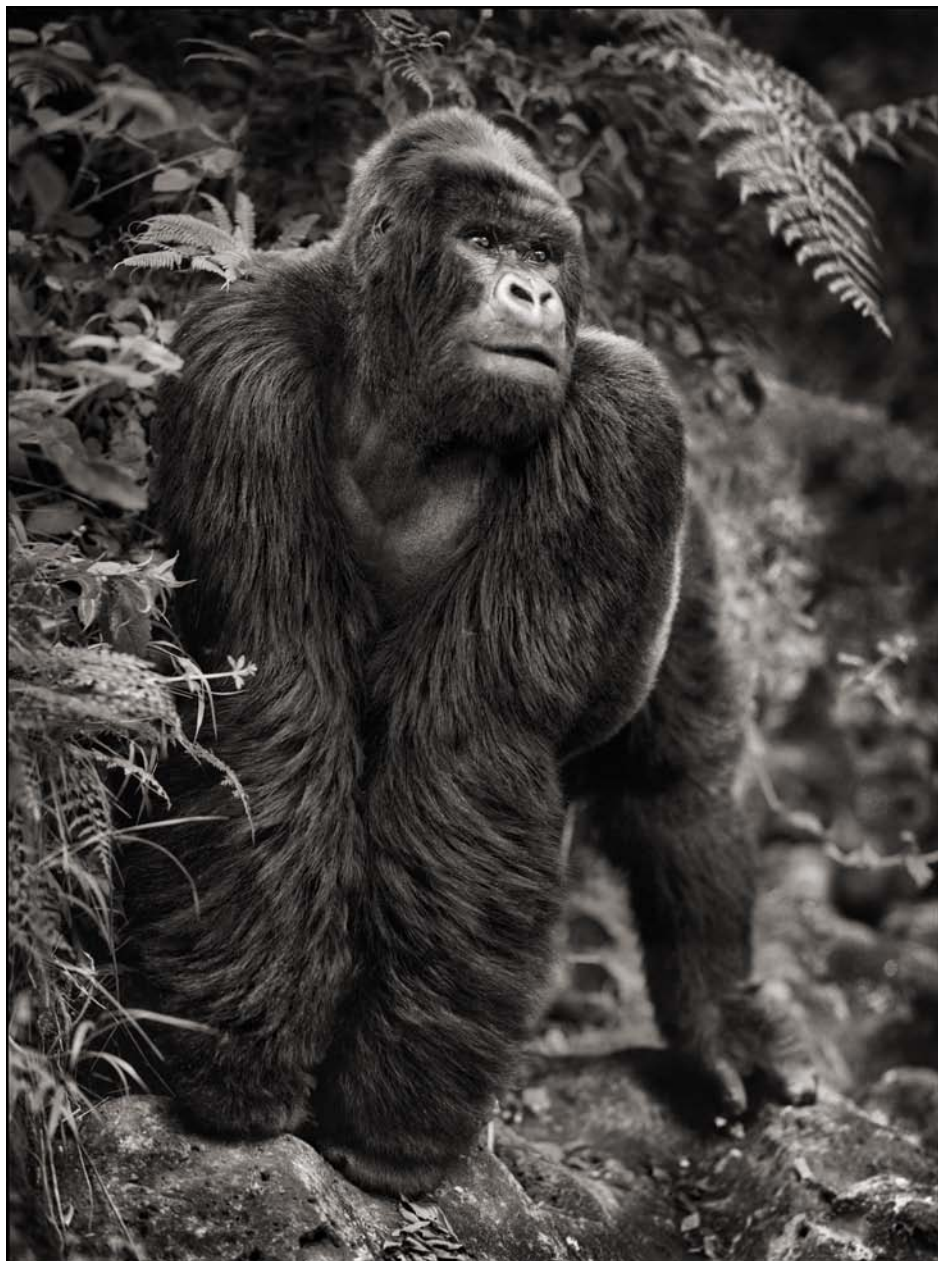
Gorilla on Rock - Parc des Volcans, 2008