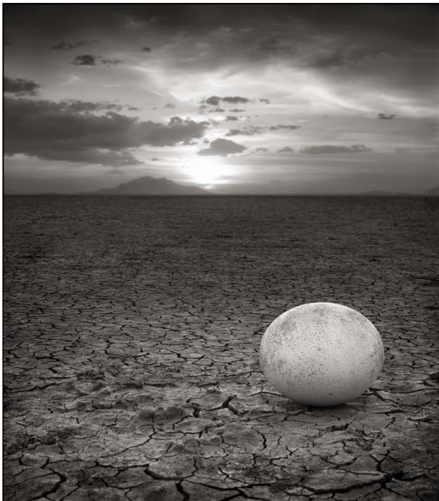
Abandoned Ostrich Egg, Amboseli, 2007 - © Nick Brandt, courtesy of Hasted Kraeutler Gallery, New York

to the destructive hands of man. But comparing the photo to portraits of the 19th century is appropriate, as I deliberately want to make the images appear as if they were from a bygone era, as if these animals that I've photographed are already long dead. I also photograph animals in exactly the same way as I would photograph a human being, except that I have to wait for the moment for them to present themselves for their portraits."