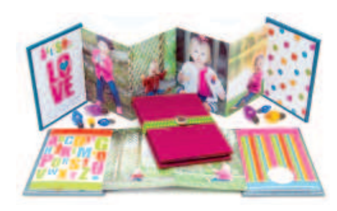
Modified templates by Pinkle Toes 4 Photographers, pinkletoes4photographers.com

cottons to stunning silks and chromes. Standard, enhanced, specialty, and green paper options are available. My clients go crazy over the lush feel of the smooth matte stock. One design on three booklets per order, $6 each. prodpi.com