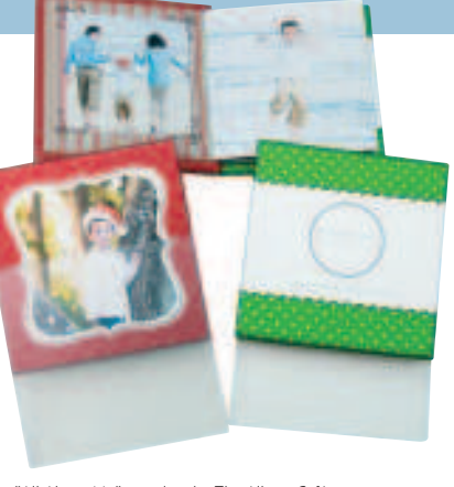
"All About Me" template by The Album Café,

that are the perfect gifts for clients to show off as mini brag books. Available in both wallet and 3x3-inch sizes, there are five press-