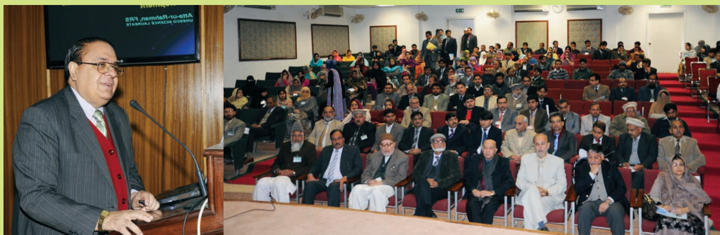
Prof. Dr. Atta-ur-Rahman addressing at Inaugural Session of the Conference