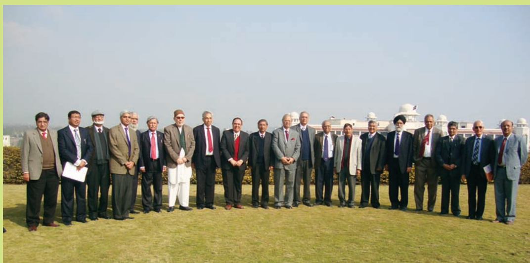
The INSA delegation with the PAS Council