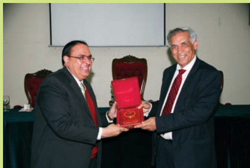
Prof. Atta-ur-Rahman, presents PAS Shield to President, INSA

Souvenirs were exchanged by the two Academies to make this trip a memorable one.