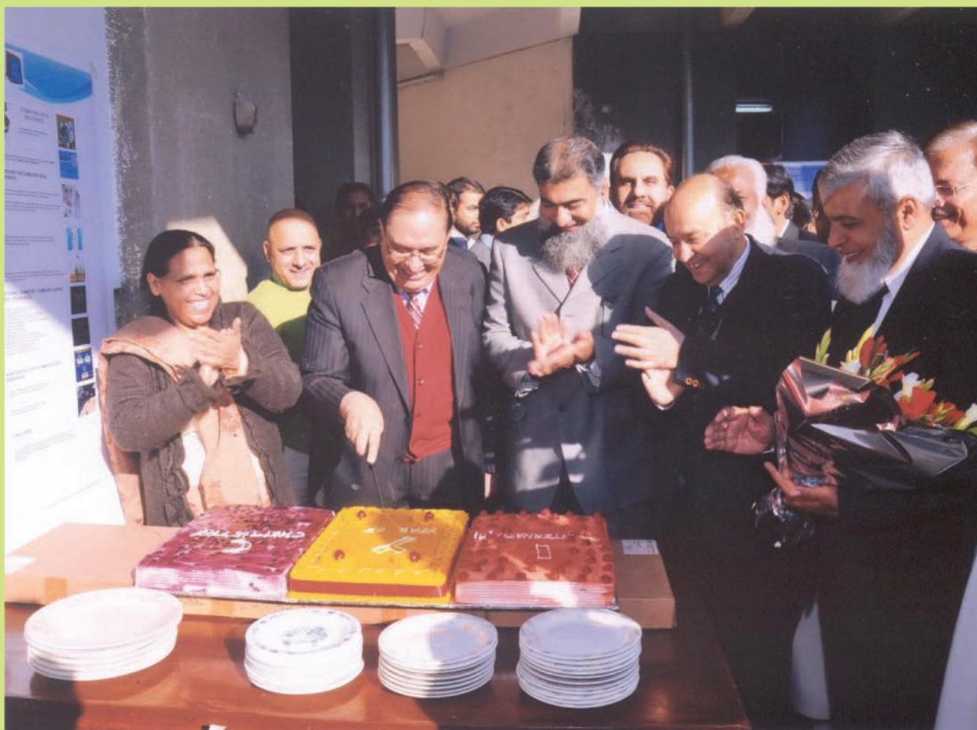
President, PAS cutting the cake at the “Celebrate Chemistry” Seminar.