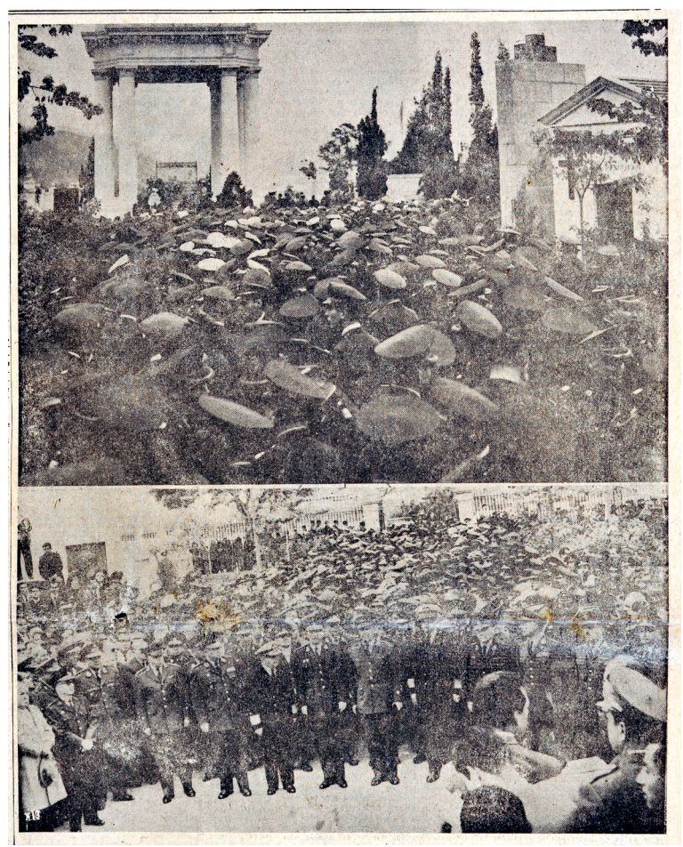
Figure 4. Military ceremony on July 9, 1962 in tribute to victims of the 1932 massacre

1948 "the army's annual services commemorating the 1932 events became more elaborate than ever." <sup>102</sup> After a period of relative silence on these events, El Comercio , starting in 1957, began to give front-page coverage to the elaborate military commemorations of the Trujillo events. The photographs of the military's top brass congregated before the tombs of the fallen Trujillo soldiers in Lima's cemetery were impressive, and seemed to