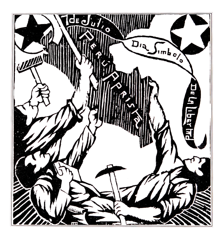
Figure 2. "El día símbolo," by Mariano Alcántara (1934)

intellectual (with a book)—symbolizing APRA's alliance of manual and intellectual workers—holding up a map of Peru labeled "Perú Aprista." Across the top, a waving banner reads "7 de Julio. Día Símbolo de la Libertad." It seemed, at this early stage, that July 7 might yet become an important date in APRA's foundational mythology.