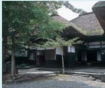
Old Nara House

Access About 30 minutes from Akita Station by car, about 20 minutes from Oiwake Station on foot. Tel.:018-873-4121