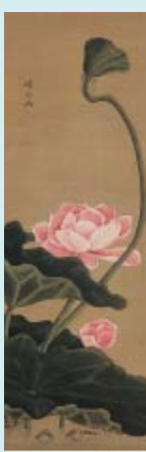
"Scarlet Lotus" by Satake Shozan (at Akita Senshu Museum of Art)

Access About 4 minutes from Akita Station on foot. Tel.:018-836-7860