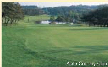
Akita Country Club