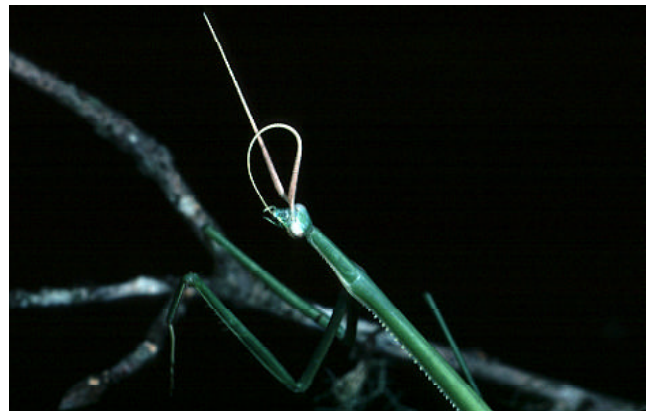
Fig. 2. Brunneria , thick antenna