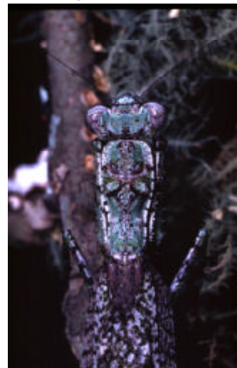
Fig. 4. Gonatista pronotum