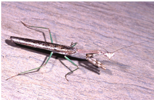
Fig. 1. Male Stagmomantis , thin antenna