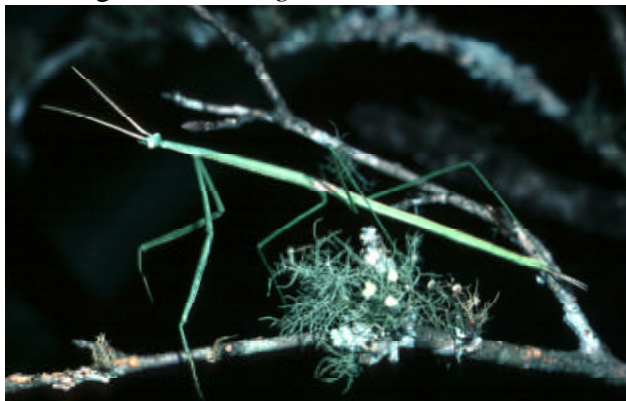
Fig. 3. Brunneria borealis