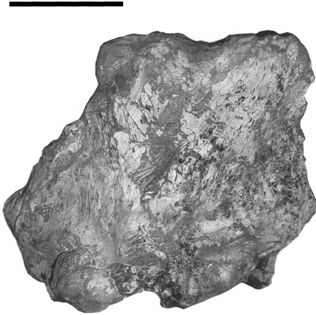
FIGURE 2. Occipital surface of Parelasmotherium linxiaense from the upper Miocene at Guonigou, Dongxiang in the Linxia Basin (Gansu, China), HMV 1411. Scale bar equals 10 cm.

bones are completely fused with each other. The orbit is close to the skull roof, and its lower rim is raised. The supraorbital tuberosity is weak, the lacrimal tubercle is absent, and the postorbital process is well developed. The anterior end of the zygomatic arch is narrow and slightly uplifted, at the level of the posterior margin of M3. The facial crest is well developed, with an angle of 100^\circ and a vertical ascending branch.