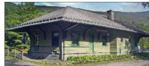
The restored Phoenicia Station is home to the Empire State Railway Museum.

Adult — $14.00 Children Under 12 — $8.00 Children under 4 ride free with paid adult fare