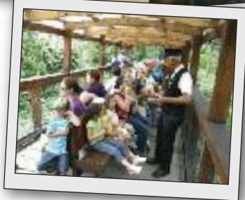
First train crossing the newly reopened bridge over the Esopus Creek in Dec. 2012!