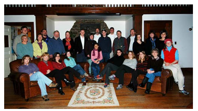
The New Hampshire and New York staff during their annual meeting in January.

We often talk about time at MacDowell. Artists-in-residence marvel at the expansiveness of time, the quality of time — blessed, uninterrupted time — and the necessity and joy of making time for one's work. It all comes under the broad heading of "MacDowell time."