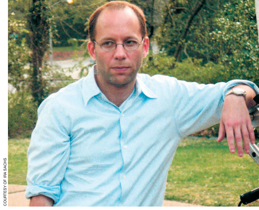
Ira Sachs on the set of Forty Shades of Blue.