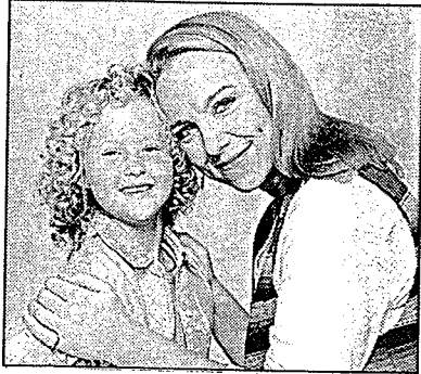
‘GRACE UNDER FIRE’: Kaitlin Cullum, left, and Brett Butler star in No. 9 show.