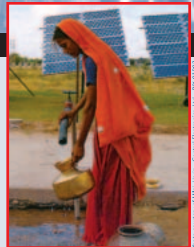
Bringing electricity to the world – a woman in India collects potable water provided by a PV-powered pump.

NREL's public, civic, and international outreach programs convey a compelling message about the benefits of sustainable and secure energy. Working with DOE, we produce more than 200 scientific papers and a broad spectrum of publications annually. And in the past three years, through NREL's Communications programs, we have created comprehensive Web sites to spread the word about efficiency and renewable energy technologies. Our Energy Analysis Office combines NREL's unique knowledge of technologies, markets, and policies to provide a world-class analysis capability. And NREL's Education programs help educate up-and-coming scientists and engineers – ensuring a prosperous and sustainable energy future.