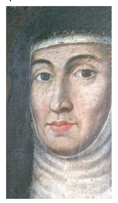
Detail of 17<sup>th</sup> century portrait of Sor María, age 38-42. Oil on canvas, artist unknown. On display in convent museum, Ágreda, Spain.