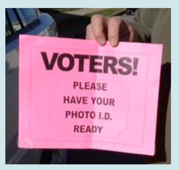
Misleading sign at a Pennsylvania polling place.

In Royal Oak, Michigan, a voter reported that, while she was waiting in a long line at the Emanuel Bethel Church polling location, a woman was standing outside shouting at the people in line, "Don't forget you need your ID to vote." When the voter questioned the poll worker, the poll worker responded that it was true that voters need photo identification to vote, but when the voter persisted the poll worker finally admitted photo ID was not required. While the voter was ultimately able to vote without identification, many reports were received from other voters who were being turned away because they did not have photo ID.