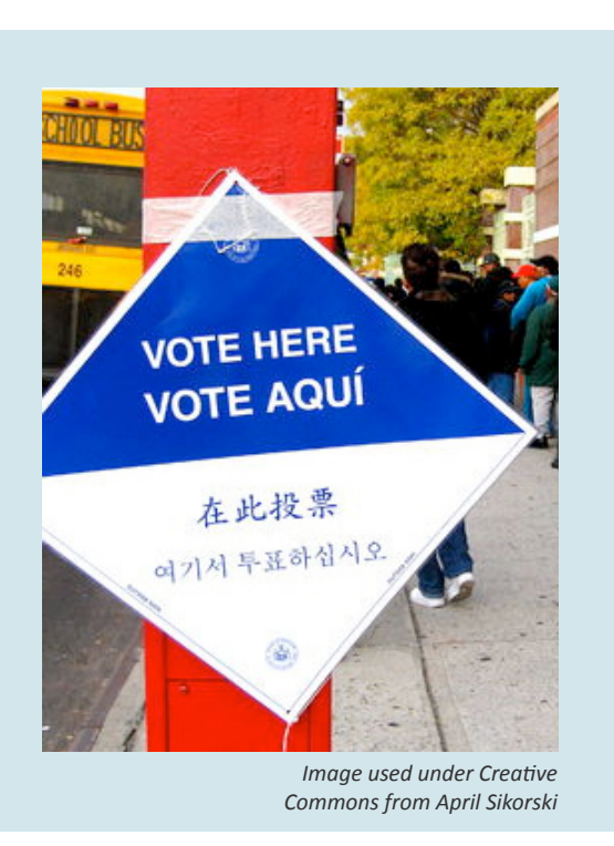
assistance. However, some polling places with Spanish language voters had no poll workers who spoke Spanish, and Spanish language assistance hotlines were inaccessible on Election Day. For example, there were no Spanish speaking poll workers available at the Police Athletic League polling place in Philadelphia. Not being able to obtain help, some voters became frustrated and left the polls without casting a ballot. In another polling place in Los Angeles, California, only the warden was bilingual, creating a long wait for voters needing Spanish language assistance.

Disabled Voters Denied Accommodations. In South Carolina, many polling locations were unable to provide curbside voting due to long lines and understaffing. A disabled voter in Richland County asked for curbside voting but was refused. Similarly, curbside voting was also denied to voters with physical disabilities in Harris County, Texas. A caller at the Bayland Park polling place reported witnessing officials deny curbside ballots to at least three voters with physical disabilities and that these voters were told to go to the end of the line like everyone else.