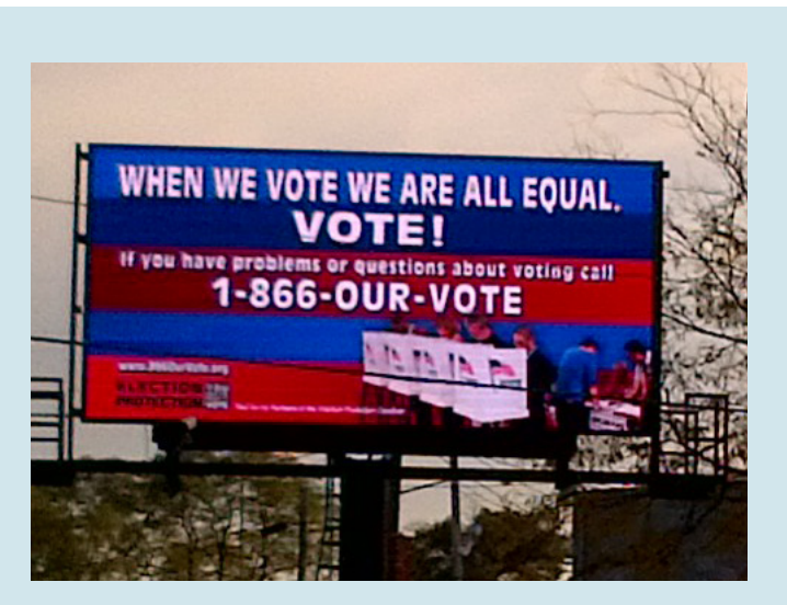
Election Protection responds to voter intimidation tactics.

not a U.S. citizen. As summer turned into fall, we saw attempts to intimidate and deceive voters pop up even earlier than usual. By mid-October, voters in Florida, Indiana, North Carolina, and Virginia were reporting that they received live phone calls falsely telling them that they could vote over the phone. Misleading information about straight-ticket voting made the rounds over email and through social networking in several states, including Pennsylvania, Texas, and North Carolina.