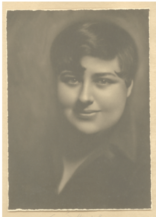
This 1928 photograph of Pancho Barnes by George Hurrell was one of her favorites and hung on the wall at the Happy Bottom Riding Club.