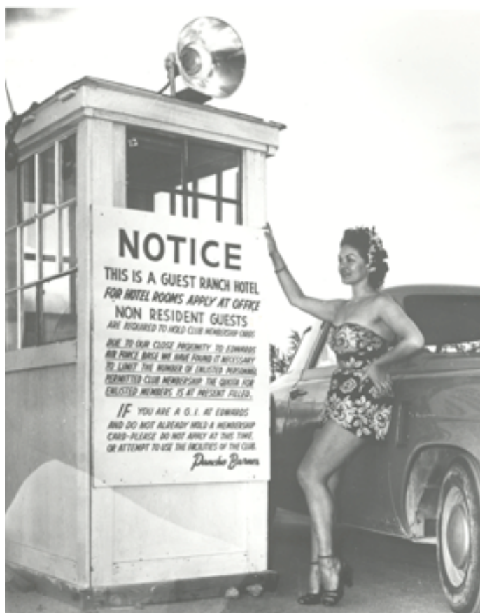
Entrance to the ranch and the Happy Bottom Riding Club. Yes, there were always beautiful women to be found in attendance!