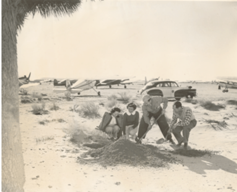
Here are some guests digging for the $200 jackpot!