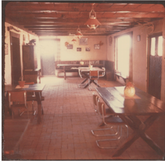
Here is a view of one of the dining rooms.