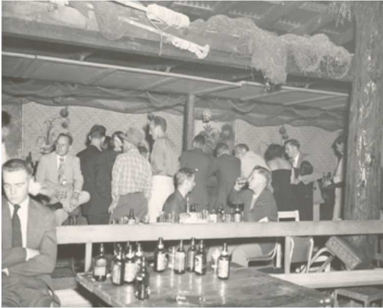
The night is just getting started at the Happy Bottom Riding Club.