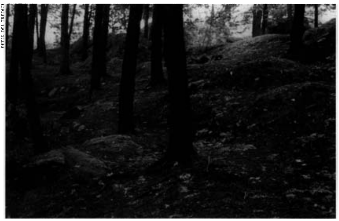
When soil is displaced by an uprooted tree, a mound and a closely associated pit are formed The pits and mounds in this photo, of Hemlock Hill in the Arnold Arboretum, were created nearly sixty years ago, in the hurricane of 1938