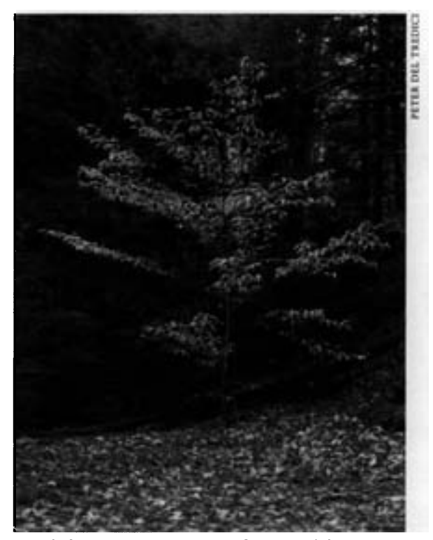
Beech leaves remain on saplings and lower tree branches throughout winter, making it easy to spot beech in a forest when other deciduous trees are leafless.

Students in the plant ecology course at Cornell University have studied beech invasion in secondary forests, and it is instructive to examine some of their results. In several older secondary forests—on land that was last farmed