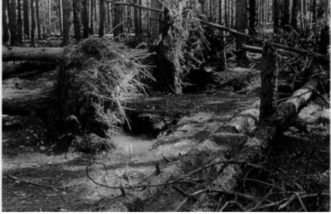
The initial stage of pit-and-mound formation. In this photo of red pine trees (Pinus resinosa) uprooted by wind, the mounds are the root balls and the pits are the original locations of the root balls