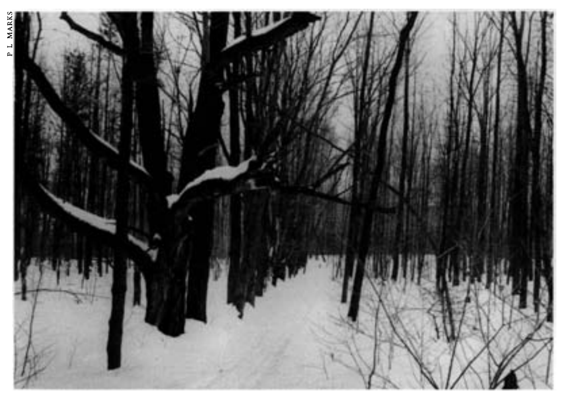
Secondary forest grows on both sides of this older hedgerow of trees, which runs from the left foreground of the picture to the center rear. Note the spreading branches growing out on both sides of the hedgerow.