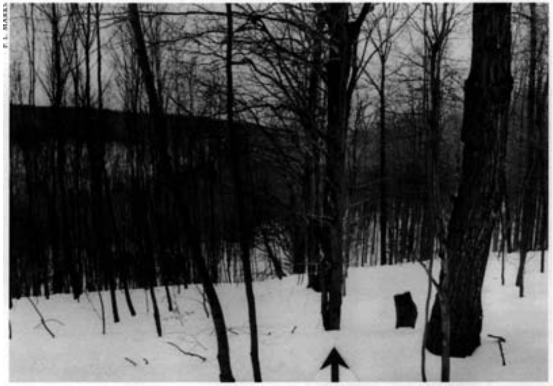
A well-defined edge (above the arrow) between an older primary forest to the right and a younger secondary forest to the left. Note the profusion of spreading branches on the left side of the edge.