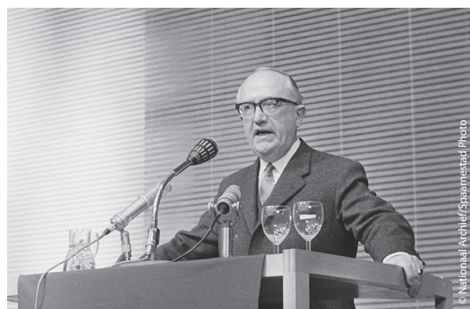
Hallstein as President of the European Commission speaking in the Netherlands in 1965.

Without Hallstein's energetic enthusiasm, diplomatic negotiating skills and strong powers of persuasion, the speed of European integration witnessed during his years in office would not have been possible.