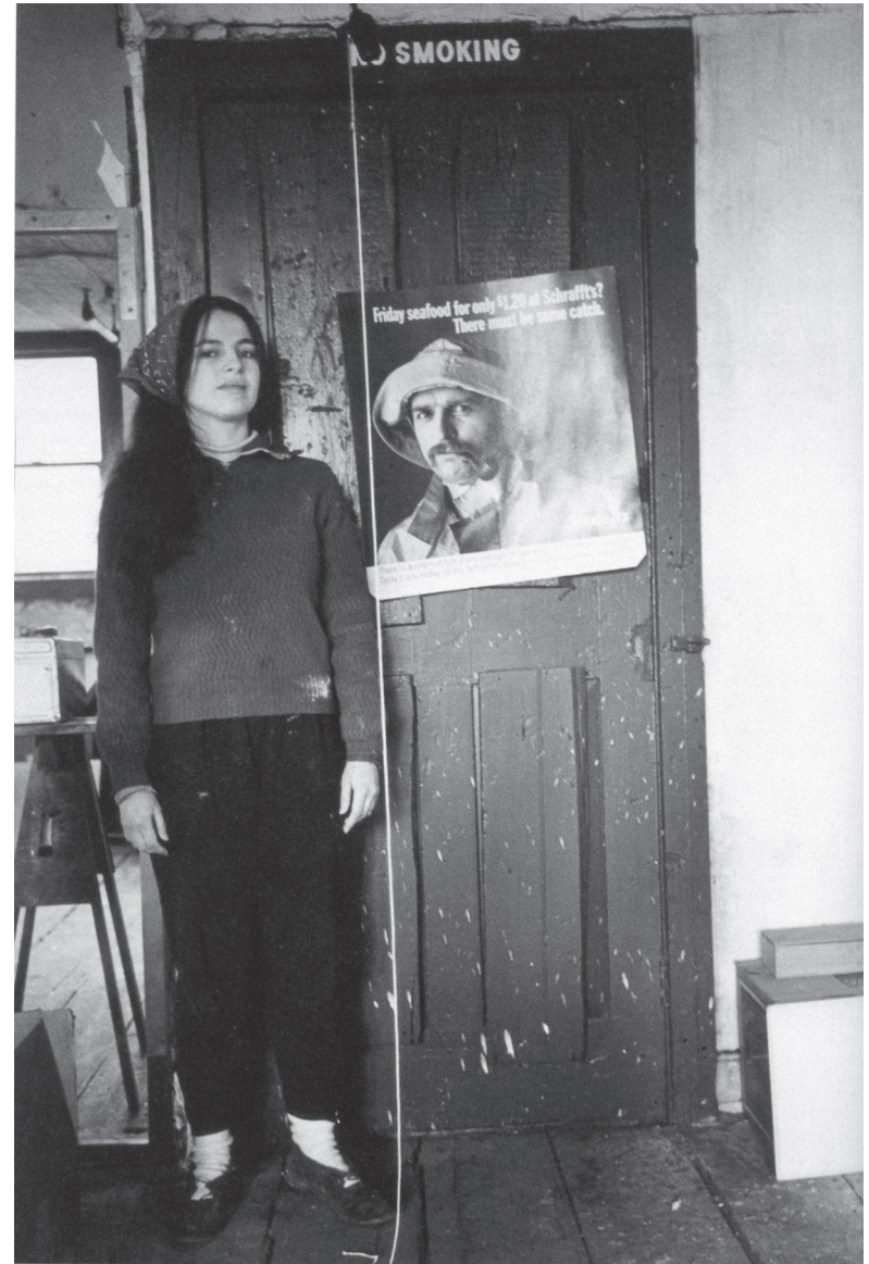
Eva Hesse in her New York studio, c. 1965