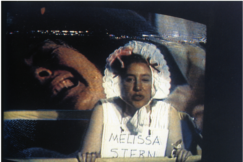
Martha Rosler, Born To Be Sold: Martha Rosler Reads the Strange Case of Baby S/M , 1988