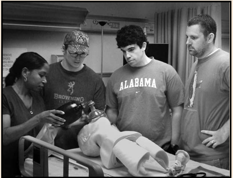
UAB Students in the Simulation Lab

The faculty and staff are expecting 62 students to enroll into the program this fall. The new class is composed of students from six regional sites and one central (or Birmingham) component. Twenty-five students will be enrolled in the central component. The Dothan area will be contributing six students. Five students will be attending class from the Huntsville area. The Jackson, Mississippi area will be represented by seven students. The largest regional site this year is Mobile where nine students claim residences. Six students are coming to school from the Montgomery area. Finally, Tuscaloosa is represented by four students.