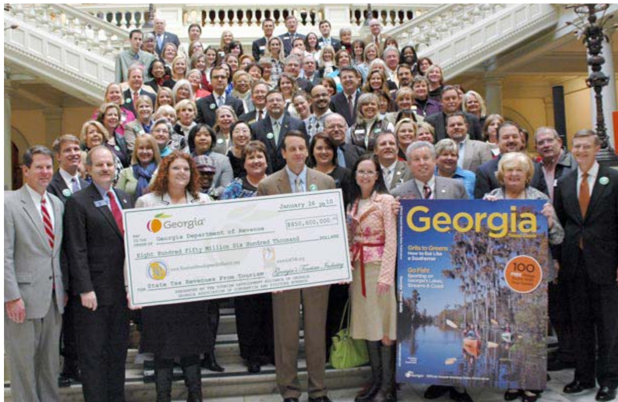
The tourism industry presented a check representing the $850.6 million in state tax revenue generated from tourism-related expenditures.