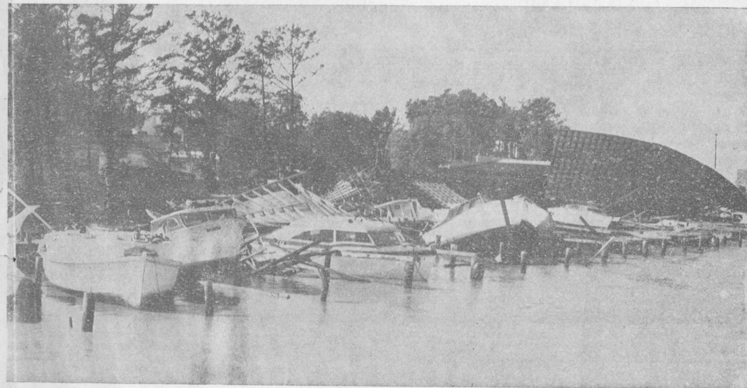
BOATS PILE UP AS WIND, SEAS BATTER DOCKS AT PARK BOAT WORKS