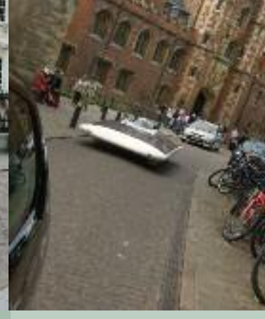
Affinity at sunset