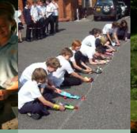
Affinity on the start line at Land's End