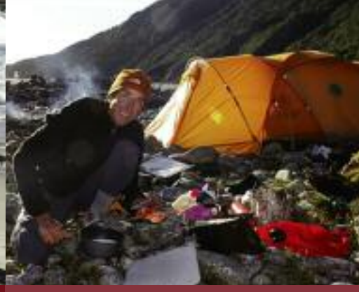
Barry, Looking Glass Bay, Fiordland

January this year and headed clockwise 2,400 km around the island.