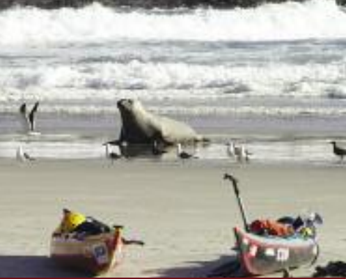
Elephant seal, Otago peninsula