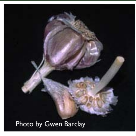
A. sativum 'Purple Glazer'hardneck; Purple Stripe group; satiny wrappers