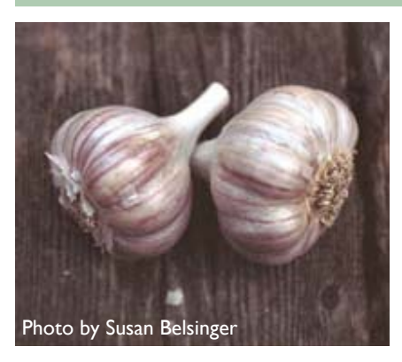
A. sativum 'Persian Star'hardneck; Purple Stripe group; cloves have red tips and marbled streaks