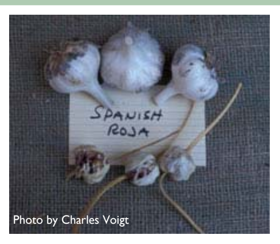
A. sativum 'Spanish Roja' (bulbs and stalks with umbel and bulbils)

- hardneck; Purple Stripe group; large bulbs with 5-7 dark brown cloves