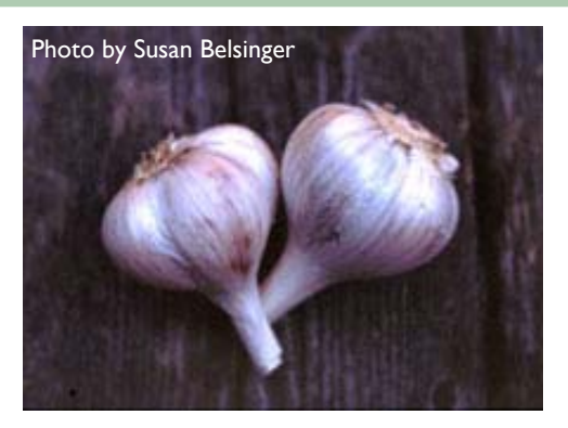
A. sativum 'Romanian Red'- hardneck; Porcelain group, 4-6 cloves per brown and purple bulb, hot