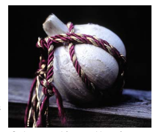
Garlic wrapped for a wedding gift

Garlic may have a reputation for producing garlic breath, but it has also long been considered an aphrodisiac. Garlic was traditionally worn by Hebrew grooms to guarantee marital bliss (6), "hung over a marital bed [to ensure] that the couple will have children" (81), and was forbidden for Hindu holy men due to its ability to inspire lust (6). Some suggest that garlic's aphrodisiac properties are due to mild irritation of genitourinary tract (81).