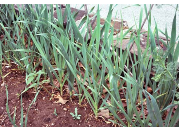
Green garlic

greens can be harvested in about 2½-3 months (5). Fall planted garlic