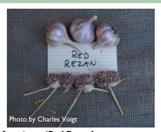
A. sativum 'Red Rezan' (bulbs and stalks with bulbils) - hardneck; Purple Stripe group; strong flavor without heat; glazed purple and gold bulb