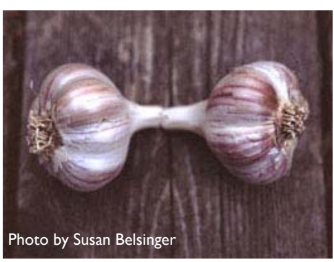
A. sativum 'Siberian'

- hardneck; Rocambole group; strong flavor with hint of sweet