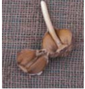
Hardneck bulb with stalk