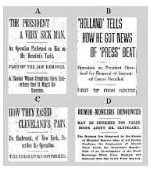
Figure 2: Newspaper headlines breaking the news of Cleveland's illness. A: Holland's initial revelation that Cleveland had an extensive operation ( Philadelphia Press , Tuesday August 29, 1893). B: Following the publication of Keen's book in 1917, E. J. Edwards finally reveals the first source of the story about Cleveland's operation ( Philadelphia Press , September 26, 1917). C: Although Hasbrouck described the operation in this 1893 interview, he did not reveal that he was the source of the initial "leak" ( Philadelphia Press , Wednesday, August 30, 1893). D: Threat of punishment for "Rumor Mongers," e.g., Hasbrouck and Edwards ( New York Times , Thursday, August 31, 1893).

Denial of Holland's story by official government spokesmen was swift. One by one, the participants in the operation vehemently denied the story in the Philadelphia Press as a hoax. They dismissed Hasbrouck, to whom the story was eventually traced (Figure 2 C), as an insignificant and incompetent dentist who had been asked to pull some of the President's teeth, had botched the job, and had been asked to leave the boat. Bryant vowed never to speak to the dentist again. Several members of the government suggested a severe punishment (Figure 2 D) to those, including Hasbrouck, who spread lies about the President's health.