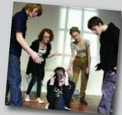
With the help of a Community Fund grant the drama continues at the Burnley Youth Theatre.

Contribution towards the running costs and office equipment