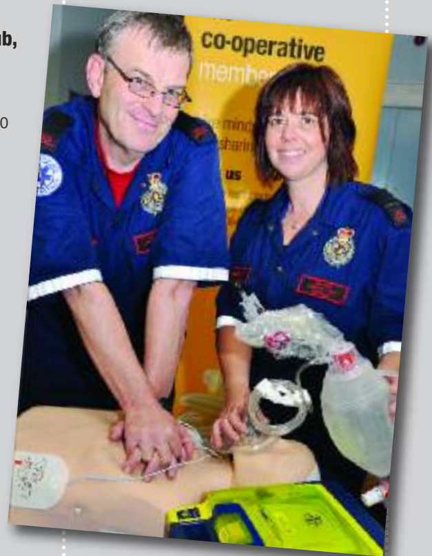
The Madeley First Response Team proudly showcase their new equipment.

To set up communal bee hives and the provision of bee keeping equipment