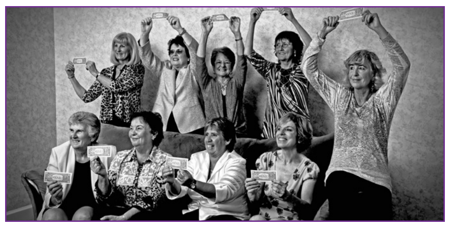
For just the second time since they took their historic stand against the establishment in 1970, all nine members of the Original 9the godmothers of women's tennis - came together in Charleston at the Family Circle Cup in April 2012.