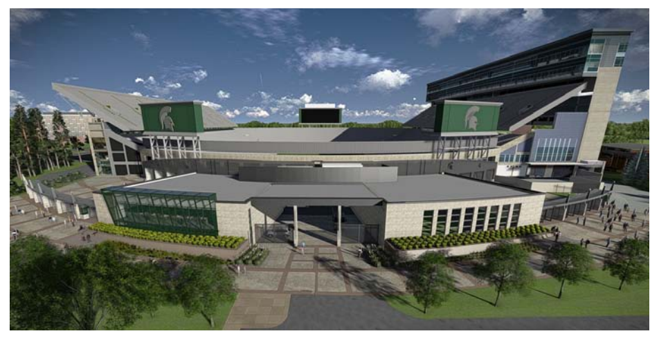
Artist rendering of the north end zone addition to Spartan Stadium.