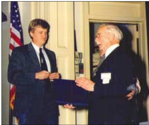
Figure 4. The author had the privilege of presenting the first university/academic award, an honorary doctor's degree, to Sir Harold in 1989.

As lens implantation gradually becomes widespread, the demand for the procedure increases, and the number of implantations should more than double by the year 2020. This development is a positive one, because, as the underprivileged world population grows and populations age, the incidence of disabling cataracts will rise rapidly. Almost all of us will develop cataracts if we live long enough. Thus ends a great story.