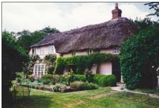
Figure 2. The Ridleys' retirement home, Keeper's Cottage, is a magnificent cottage in an idyllic region of south central England.

Based on numerous interviews with his contemporaries who observed the evolution of the IOL firsthand, the emergence of this device necessitated a radical paradigm shift. Prior to that time, eye surgeons routinely learned to take things out of the eye (ie, foreign bodies, inflammatory material, tumors). The implementation of the IOL required a new thought pattern, namely, the concept of putting something into the eye. This new idea was difficult for many to accept. Sir Harold's IOL 9-11,13,14