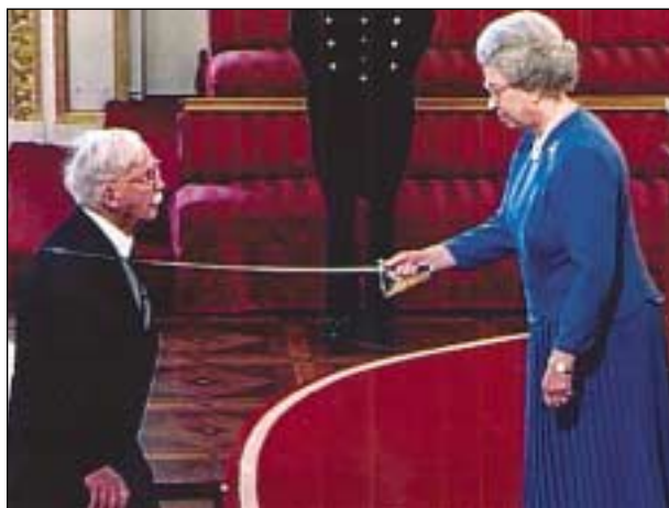
Figure 5. Queen Elizabeth II conferred a belated Knighthood upon Sir Harold in 2000.