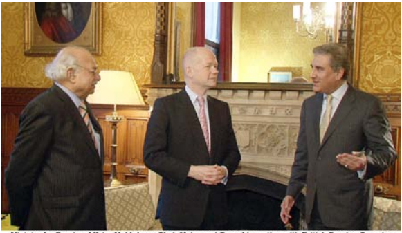
Minister for Foreign Affairs Makhdoom Shah Mehmood Qureshi meeting with British Foreign Secretar William Hague at London on December 1, 2010.