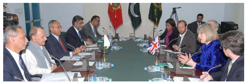
British MP, Home Secretary and Minister for Women & Eguality, Theresa May in a meeting with Federal Minister for Narcotics Control Arbab Muhammad Zahir at Narcotics Centre Division in Islamabad on October 26, 2010