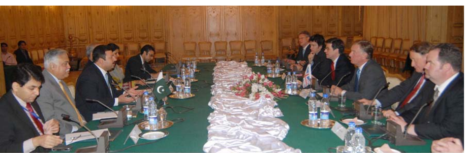
A delegation of British House of C ommon Committee on Foreign Affairs led by Mr. Richard attaway called on Minister of state for Foreign Affairs Nawabzada Malik Amad Khan in Islamabad on October 28, 2010