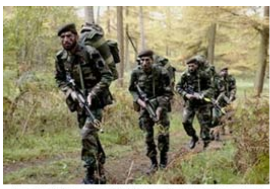
A patrol from the Pakistan Army at the start of Cambrian Patrol