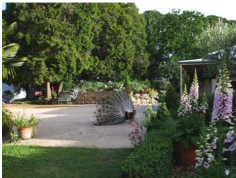
Peacocks live at Open Garden 'Bringalbit'