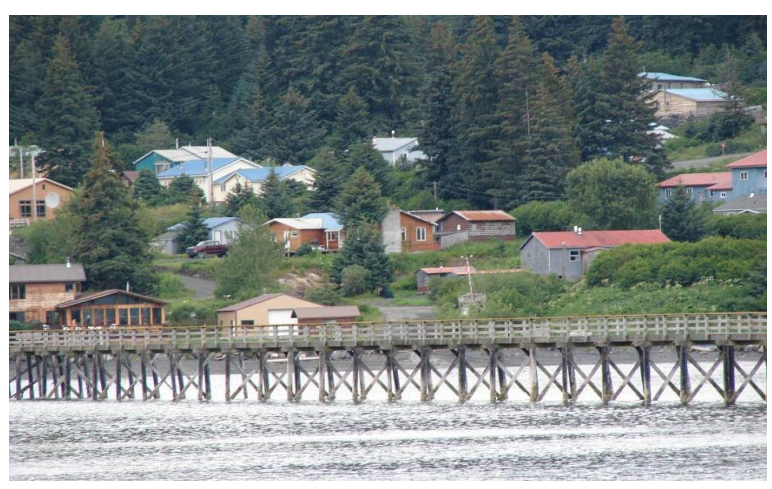
Village of Port Lions, located on Kodiak Island, Alaska

On March 27, 1964, one of the largest natural disasters in U.S. history destroyed our traditional home of Afognak with the "Good Friday" earthquake and tsunami. Following the destruction of our village many chose to relocate and build a new village on the main island of Kodiak, assisted by the philanthropic "Kodiak Island Lions Club", hence named Port Lions. Others moved to the City of Kodiak and other parts of Alaska and the Lower 48.