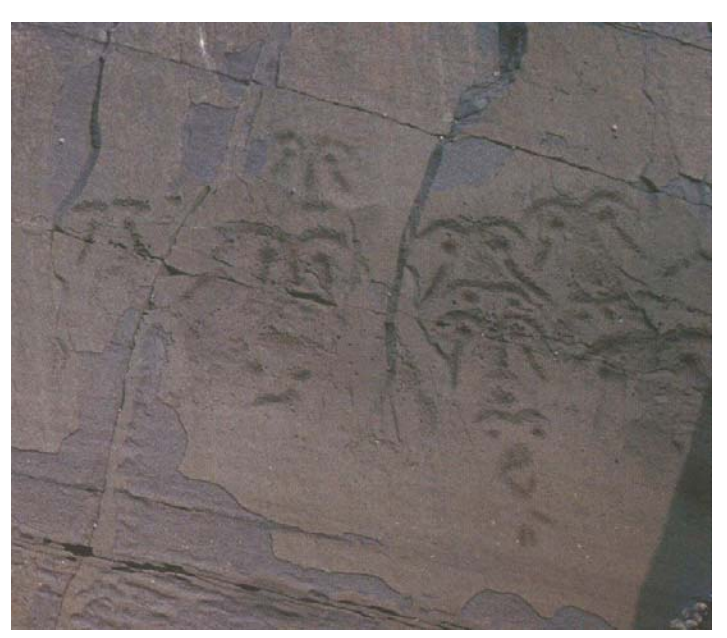
Petroglyphs carved in rock near the Village of Afognak

and his men claimed Kodiak as the capital of Russian America after defeating our people at "Refuge Rock" or what we Alutiiq have termed Awa'uq "To be Numb". It is