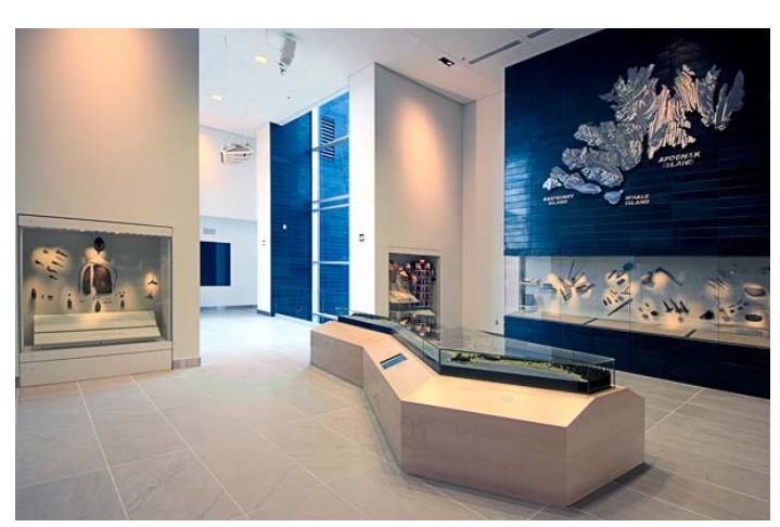
Alutiiq Museum located in the Afognak Alutiiq Center Office Building, Anchorage, Alaska

<u>Shareholders Permanent Fund</u>. The Board designed the Shareholders' Permanent Fund so that dollars from our business development operations provide long-term economic benefit to the shareholders. As of December 2007 our Permanent Fund was valued at $81.7 million.