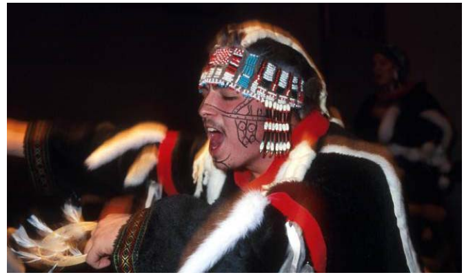
Alutiiq dancer performing in traditional regalia

Shareholder Hire/Internships. Afognak is committed to providing qualified shareholders, their descendants, Alaska Natives, and American Indians positions within our family of companies and has recently established a position to assist shareholders with job placement. Afognak also has a formal internship program for our shareholders and descendants, providing college students the opportunity to gain on-the-job skills, competitive pay and full benefits while earning their degree.