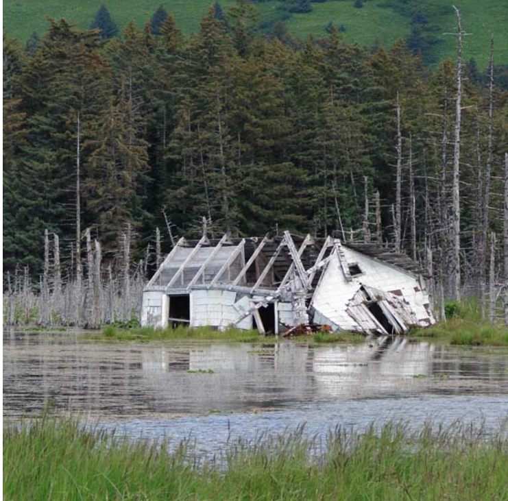
A home lay destroyed from the 1964 tsunami, Afognak Village, located on Afognak Island, Alaska

ber 18, 1971, and proved their lineage to their respective region and village. Congress termed Native corporation enrollees as "shareholders" — it is a lifetime enrollment that cannot be bought or sold. Most Alaska Natives enrolled in both a regional and village corporation. The 13th Regional Corporation was later included in the settlement to represent those Alaska Natives who, for various reasons, had lost their village and/or village affiliation. ANCSA, although not perfect, provided Alaska Natives with an avenue of economic development and