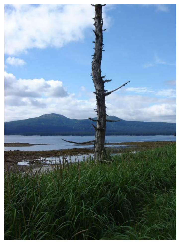
Beach at the Afognak Village, located on Afognak Island, Alaska