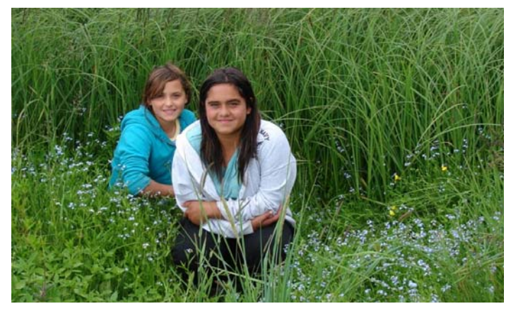
Shareholder descendants in a field of forget-me-nots at the Afognak Village

Afognak, as an Alaska Native Corporation, is responsible for meeting economic, social, and cultural obligations to its shareholders. Afognak is accomplishing this by providing benefits to individual shareholders and strengthening Aq'wanermuit "our community". It is important that these two areas co-exist because by unifying Aq'wanermuit, we develop a collective strength and by providing benefits to individual shareholders we empower every shareholder. Afognak's success has provided many benefits to our shareholders, including: