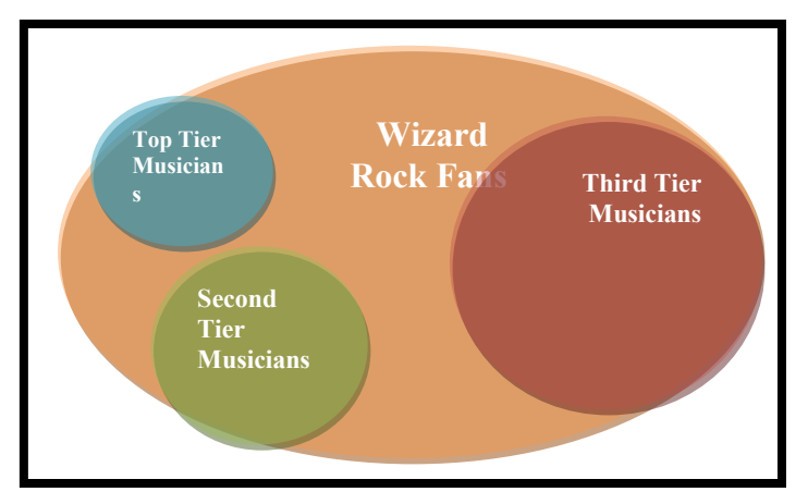
Figure 2.1 – The Wizard Rock Community

The Third Tier musicians can be considered as "undiscovered." Third Tier recording quality is often amateur. Musical skill for the Third Tier is also usually, but not always, amateur. The Third Tier is probably the most diverse of the three, if only because of quantity. It ranges from very well-produced, learned musicians who either haven't yet marketed themselves to receive popularity or have chosen not to pursue Fandom fame, to musicians who have a raw production quality and little to no detectable musical training. It also encompasses, like the other two tiers, bands of countless different musical styles.