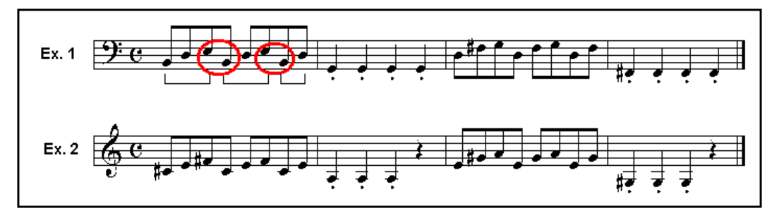
Figure 2.4 – Seven Potters Bass Line Motif

While the song is clearly in a duple meter, the beginning of the bass line is designed to emphasize patterns of three, giving it a syncopated feel. Each grouping of three is marked by a descending fourth. The four-measure theme is also divided in half, with the final two measures being a repetition transposed a minor third higher than the original statement. This particular bass pattern carries through each of the verses of the song, and is silent during the chorus and bridge. It also reoccurs in other pieces within the wizard rock repertory, and will be acknowledged again later in this discussion.