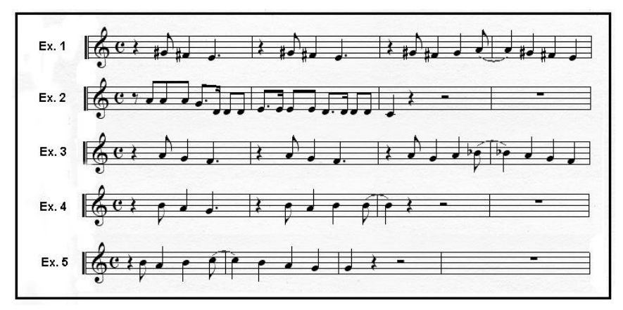
Figure 2.6 – "Bah-Bah-Bah" Theme

The musical line transcribed in Example 1 is found in each repetition of the chorus of "Looking for Trouble," where the background vocal line is "Bah, bah, bah" beneath Carpenter's first-person perspective primary lyrics. The musical line is repetitive and subtly syncopated. Melodically, it descends stepwise for the first two-thirds of the phrase, when the pattern is interrupted and augmented for the final iteration. It is a technically simple line, making it feasible for listeners to sing along and become exceedingly familiar with it. By doing this, listeners internalize the melodic lines as well as the lyrics that accompany it. This familiarity is essential for establishing the line as a musical sign and continuing its significance in the subsequent songs in the series.