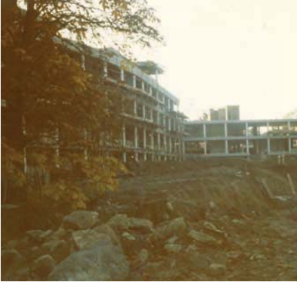
The harbour quad, then and now.