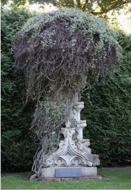
The stone pinnacle from Merton College chapel.