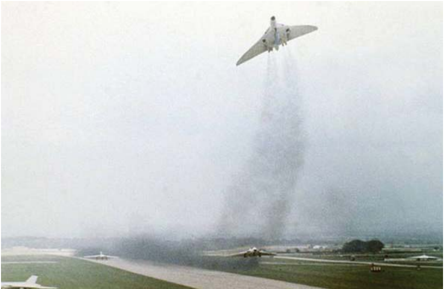
Practice Vulcan scramble (circa 1960).