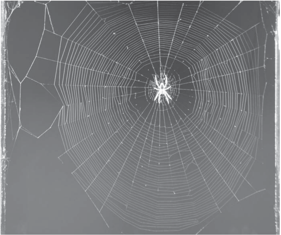
Araneus diadematus in its orb web.

In the Oxford Silk Group we take advantage of the sharp increase in knowledge of material properties of a wide range of spider silks collected in recent years, by integrating web geometry and silk material properties to gain a broader understanding of the function of the orb web as a whole. My own research focuses on the ability of webs to withstand wind damage. Wind is one of the main environmental hazards to webs, and as a consequence the spider has evolved web modifications and behavioural adaptations to wind. Webs built in wind are for instance typically smaller and have a larger mesh size (the distance between two subsequent turns of the capture spiral along a radius), and thus achieve a reduction in wind resistance. Observations also suggest that spiders increase the thickness of the individual silk fibres in response to wind. I use two methods to explore this. First, I conduct experiments to see how webs of different species behave when