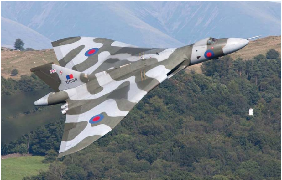
A Vulcan at low level.