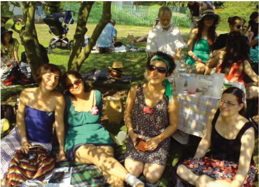
Wolfson Garden Party, June 2010.

telephone: 00 44 1865 274100 fax: 00 44 1865 274140