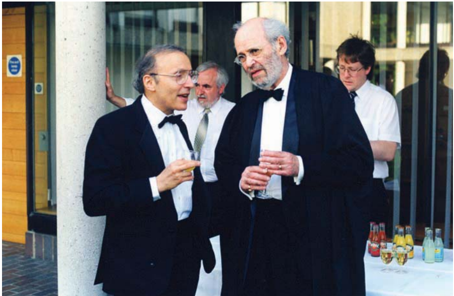
Erich Segal with Geza Vermes at the opening of the Berlin Quad on 20 June 1998.

The book was an international success, the bestselling novel in the United States in 1970, translated into more than 20 languages. The British paperback edition immodestly labelled itself “the most vital bestseller of our time”. But Love Story had begun as a screenplay and Segal turned it into a book only because he could not get a studio or producer to back a film version.