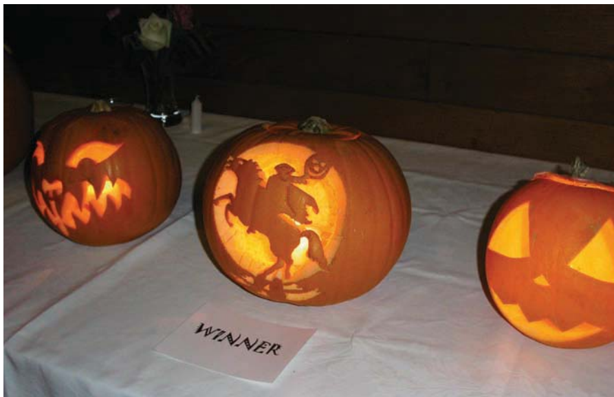
Winner of the best pumpkin competition.