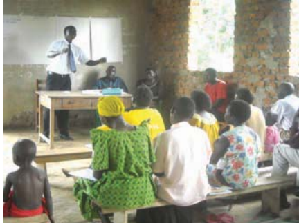
A Community Health Workers training session in Soroti district.

The African Medical and Research Foundation, whose headquarters are in Nairobi, is active throughout Eastern Africa and certain other parts of the continent, its work concentrating on essential medical provision and inculcating principles of preventive and public health, in particular by initiating community projects, by establishing basic facilities, in crowded city slums