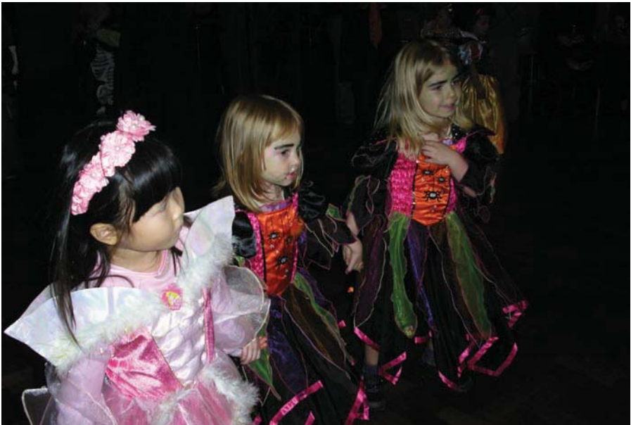
Wolfson children at the Hallowe'en party.