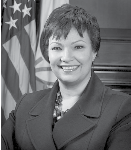
Lisa P. Jackson