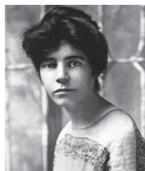
Alice Paul (posthumously) Women's Rights Suffragist and Author of the Equal Rights Amendment