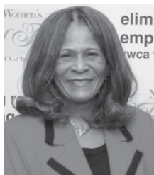
Coach C. Vivian Stringer Head Coach Rutgers Women's Basketball