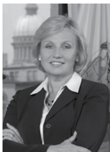
Lt. Governor Kim Guadagno State of New Jersey

On March 31, 2011, the YWCA Trenton proudly inducted the Inaugural Class of the New Jersey Women's Hall of Fame: