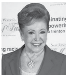
Mary Higgins Clark World Renowned Author

On March 29, 2012, the YWCA Trenton proudly inducted the 2012 Class of the New Jersey Women's Hall of Fame: