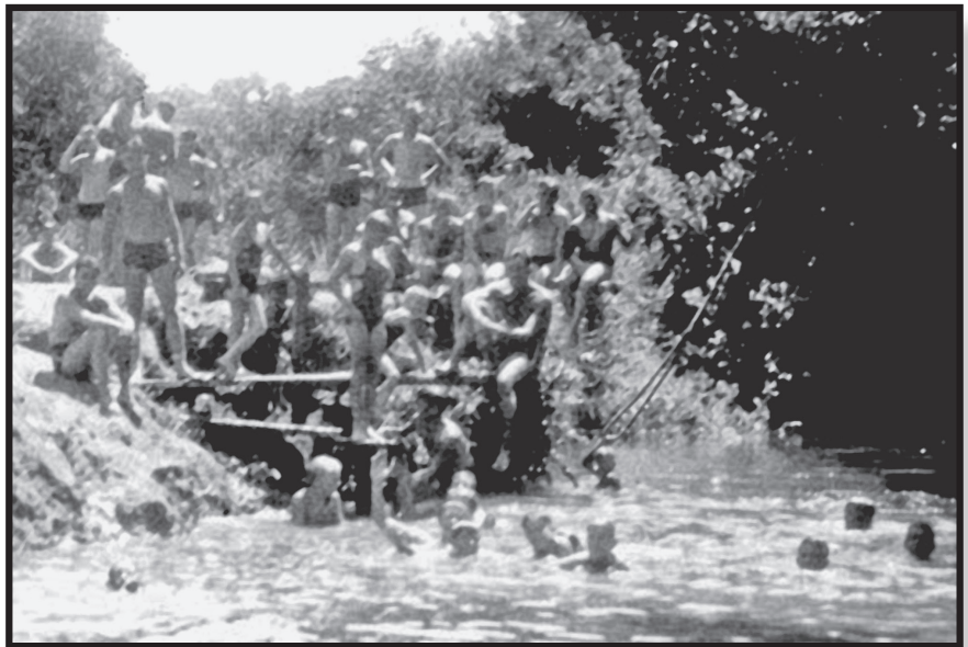
Enjoying the swimming hole