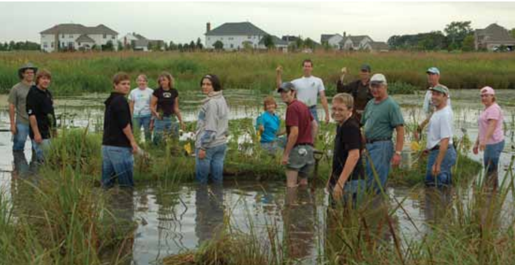
Top: Baker's Lake Heron Rookery Below: Volunteers installing CFC's floating islands

CFC monitors streams, animals and birds including bluebirds, wood ducks and frogs. All are important indicators of healthy ecosystems. Our preserves are open to members for hiking, bird watching and nature walks. We regularly schedule tours for neighbors and for school and community groups.