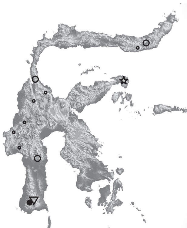
Fig. 1. Map of Sulawesi showing the distribution of Sulawesi Occidozyga . Legend: Circle, Occidozyga semipalmata ; small circles denote localities with one or two specimens; Circle, Mount Lompobatang (the type locality); Star, Occidozyga tompotika ; Inverted triangle, Occidozyga celebensis . Map modified from Google map.

Mount Karua together with those from Mount Lompobatang, Kebun Kopi and Bogani Nani Wartabone National Park show very little differences in finger and toe tips and are lumped together as O. semipalmata . For this reason, only the population from Mount Tompotika, the most distinctive form, is described below as the new species.