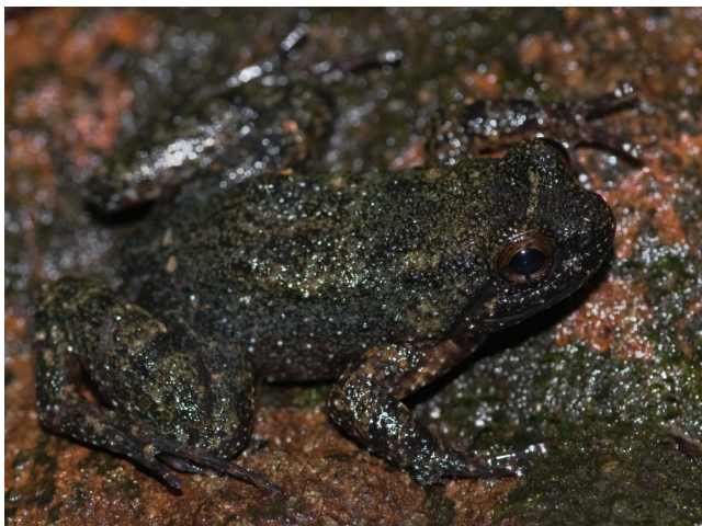
Fig. 2. Occidozyga semipalmata from Lore Lindu, proximity of Kebun Kopi showing the flattened finger disks ornamented with a white bar.

Coloration in life. – All specimens are dark brown or blackish, usually without faint markings, pattern or mottling. Lower parts are heavily marbled with dark brown and gular surfaces more heavily marked. Lips uniform as other parts of head and body, not barred although the region below the eyes is distinctly darker, bearing a single white dot exactly below the eyes. A similar darker area is on the lip below the nostril. A pineal spot is faintly present. Upper arm is essentially uniform, with no bands visible. The femur and tibia have three indistinct dark cross bands. Few white spots are scattered at the sides of body and head and lower parts of sides and on the hands and limbs (Fig. 1). All fingers and toes have a white bar straddling the middle of the truncated, flat disk and a brownish tint in the middle of the white bar. The iris is dark brown with indistinct reticulation. A mid-dorsal light line is present in two specimens including the holotype (DTI 2812), but there is no indication of lighter dorsolateral band.