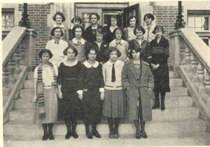
Student Staff of "Linden Leaves", the College Annual