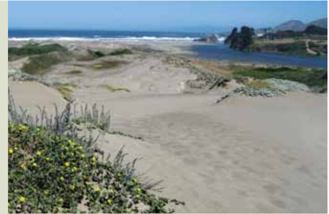
Inglenook Fen Ten Mile Dunes Preserve

The headlands leading to Laguna Point are blanketed with a thick mat of grasses. Velvet grass, sweet vernal and several other varieties of grasses and wildflowers cover the headlands that extend to Pudding Creek, site of a popular beach and the Pudding Creek Trestle.