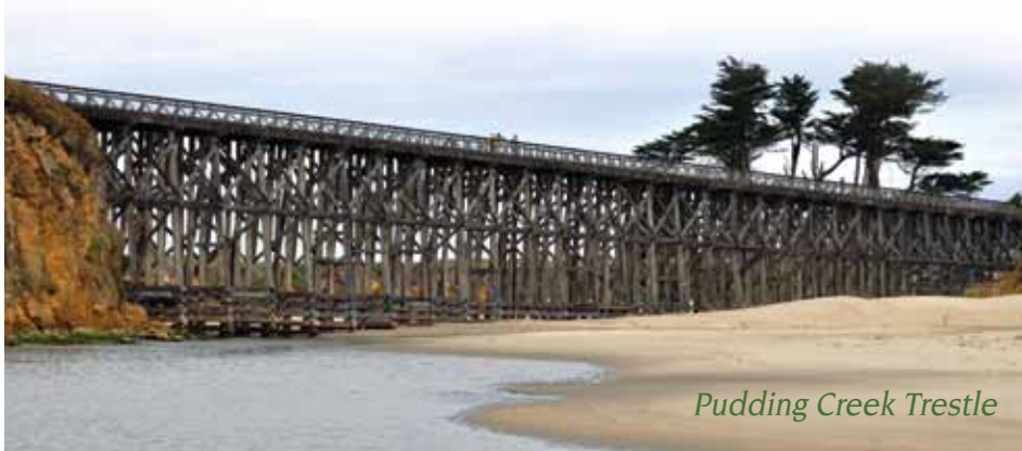
Pudding Creek Trestle

Three miles north of Fort Bragg on Highway 1, the entrance road leading to the Laguna Point boardwalk passes three campgrounds and Lake Cleone. The picturesque overpass near Lake Cleone once carried steam-driven trains to the former Union Lumber Company mill in Fort Bragg. Today, walkers, joggers, equestrians and bicyclists use the haul road, as it is historically called. This road once extended from Fort Bragg to the